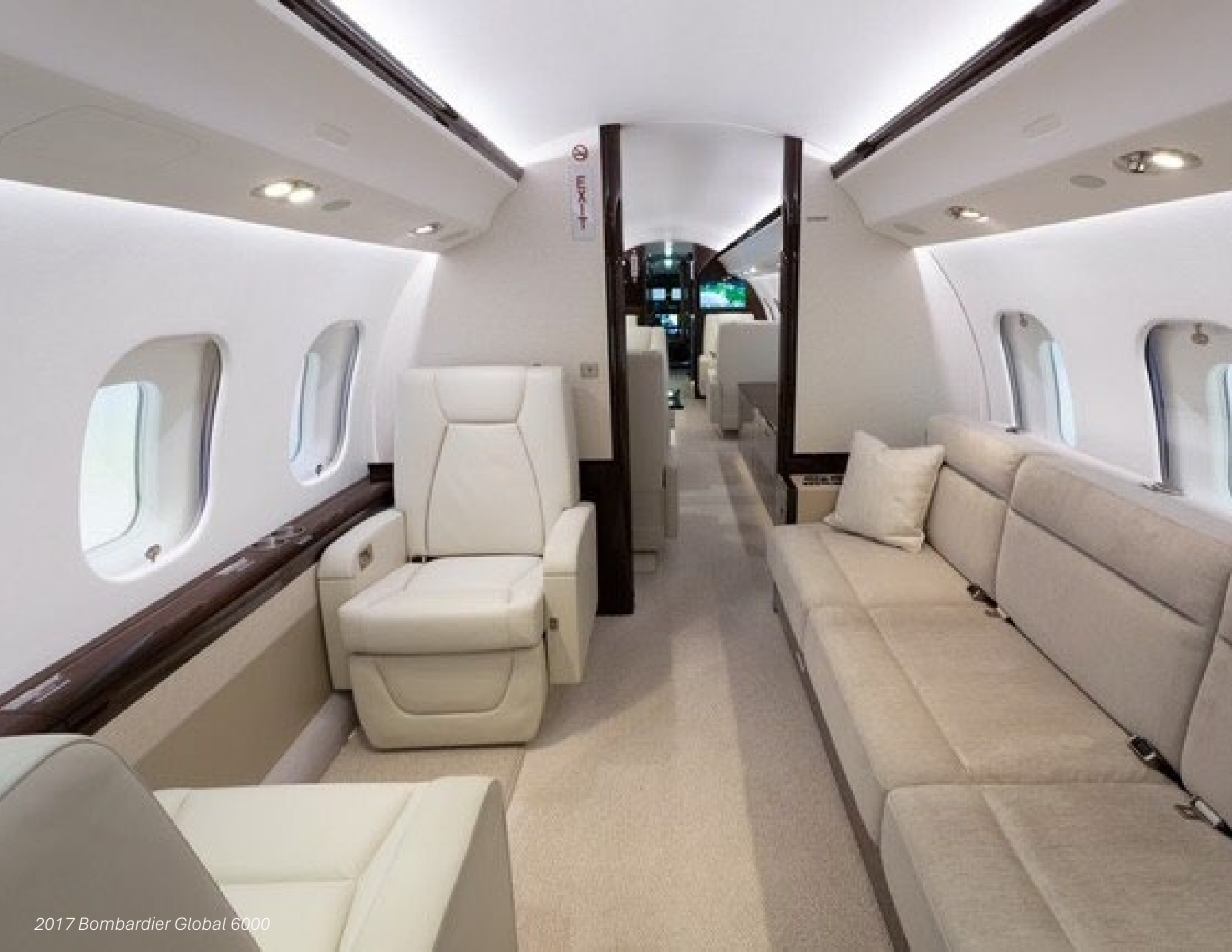
2017 Bombardier Global 6000