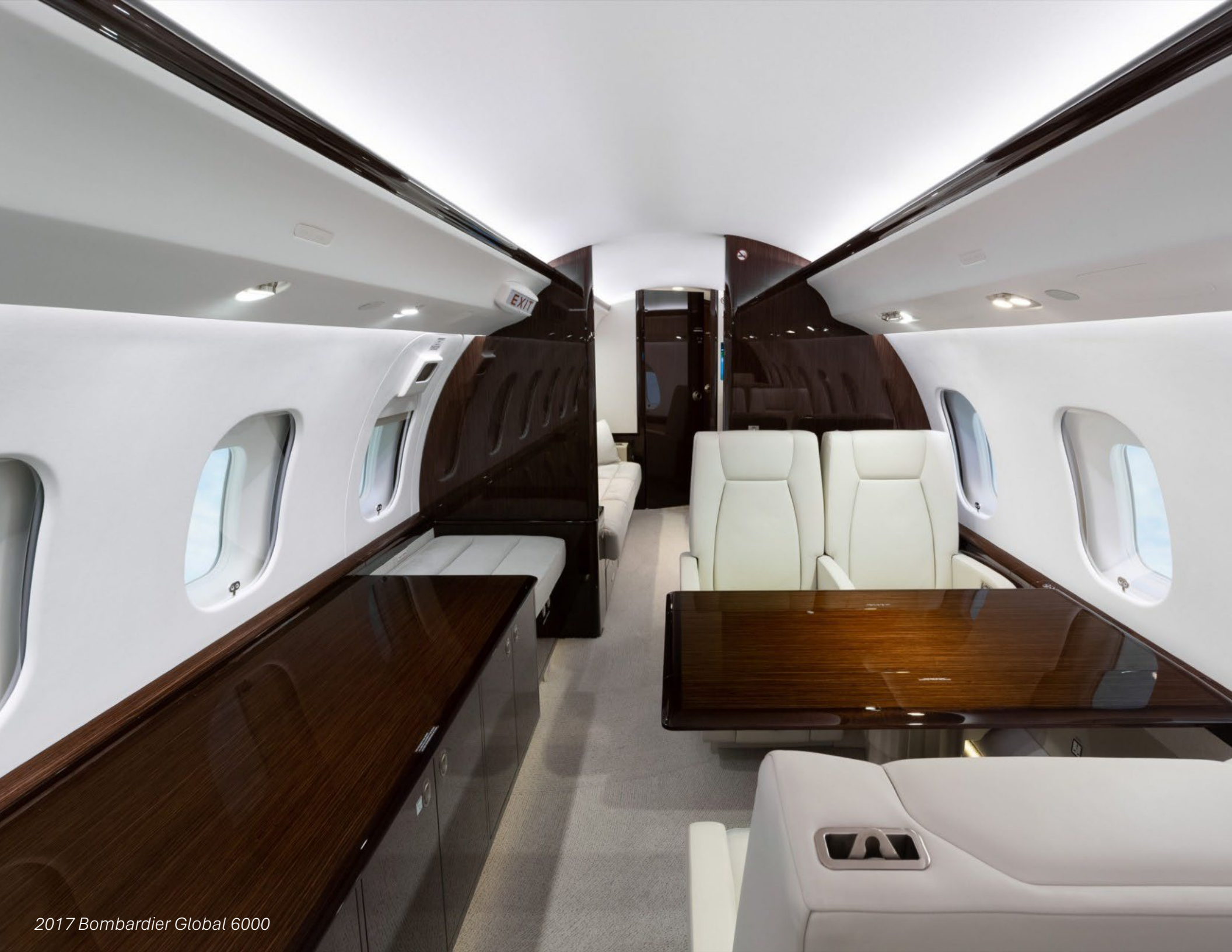
2017 Bombardier Global 6000