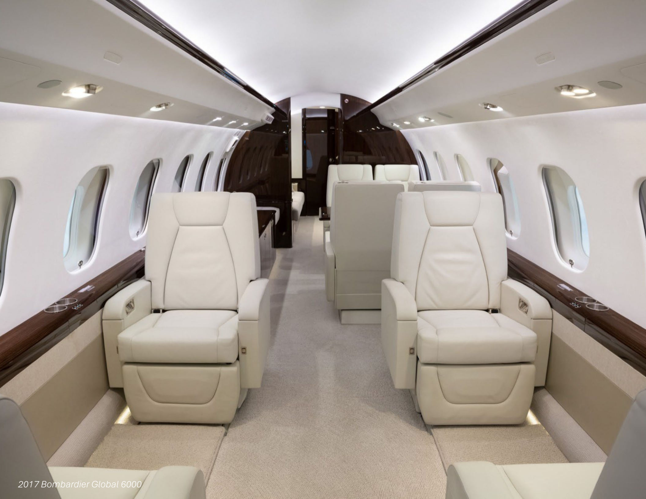
2017 Bombardier Global 6000