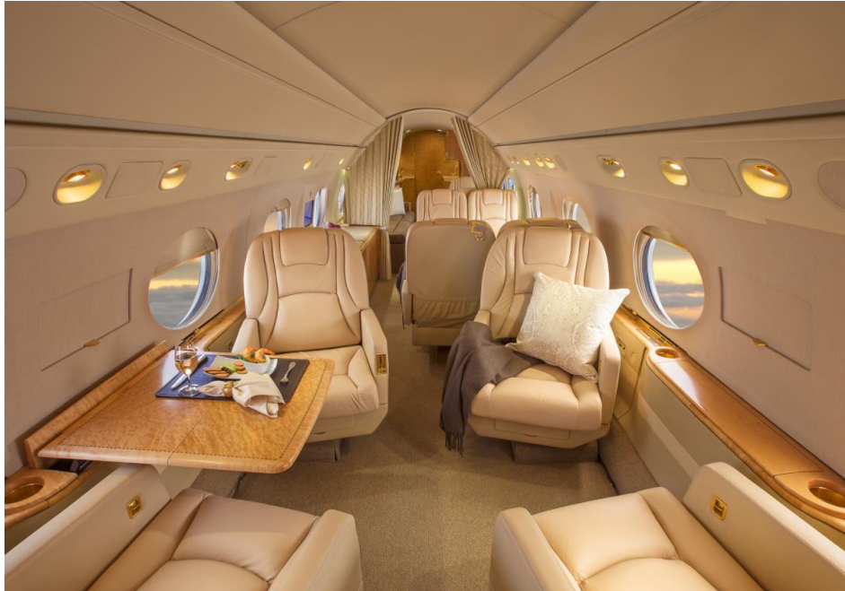
The 4-Place Forward Club is an ideal place to spend quality time with family or colleagues.

Perfect layout for business or pleasure.