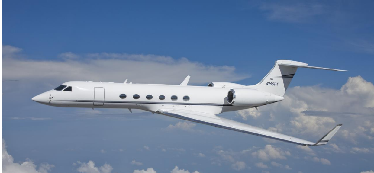
Overall White Exterior with Dark Blue Accent Stripes

Bold and graceful Gulfstream V Serial Number 550.