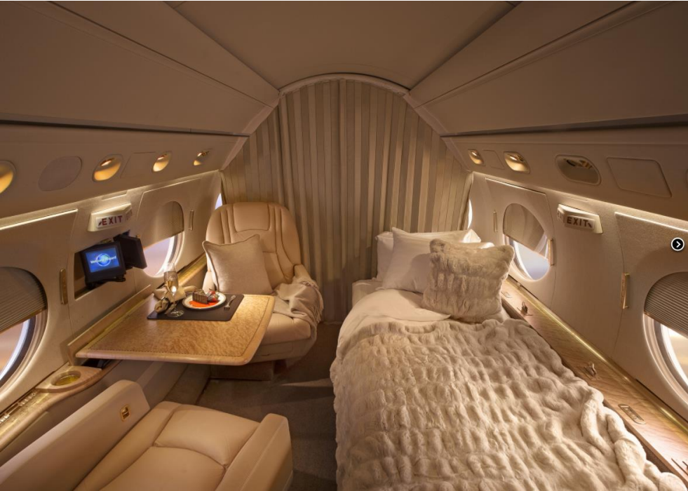
Full privacy for your trips overseas. Arrive rested and ready to go.