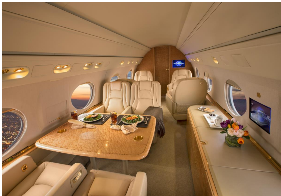
The mid cabin area is designed to enjoy a perfect gourmet dining experience at 47,000 feet.