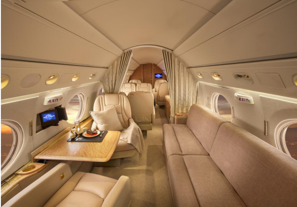
The Aft Cabin area is the perfect place to relax individually or with a group.