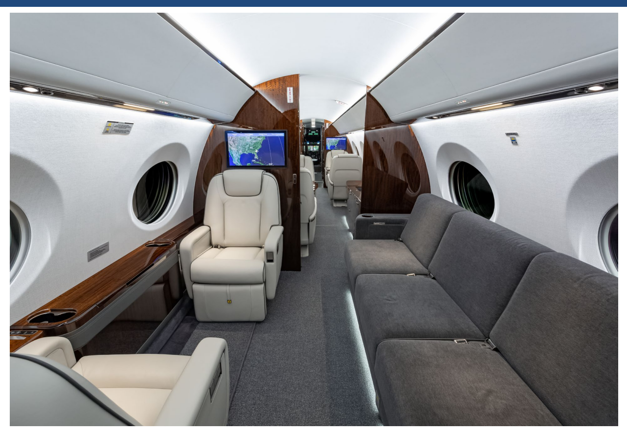
Aft Cabin Looking Fwd