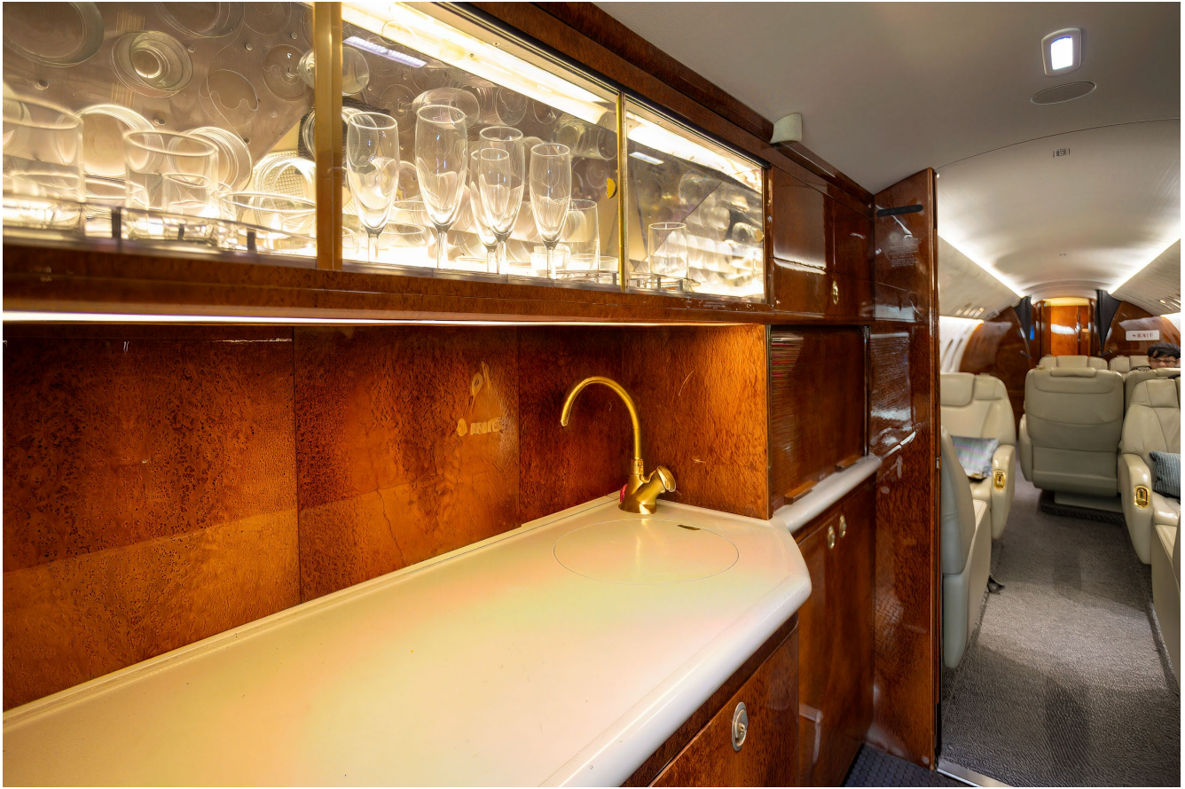
Fwd Galley looking forward