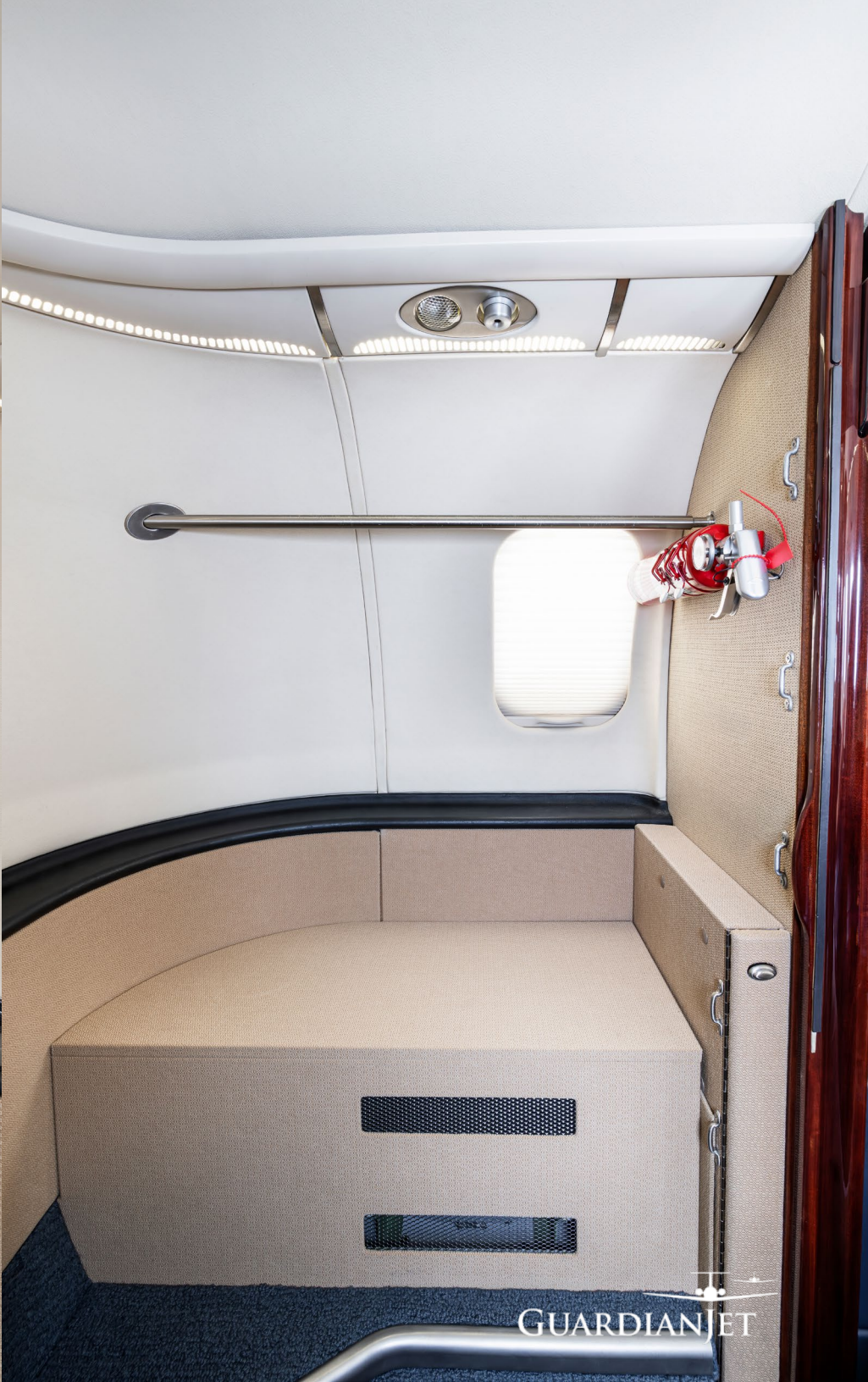
2002 Lear 45 | N645FD | SN 45-227