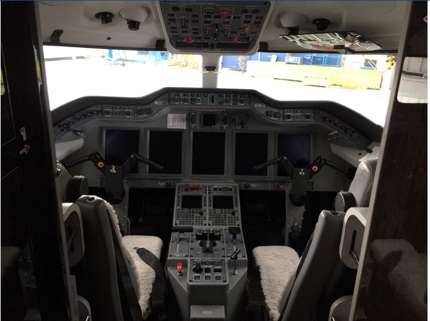
Honeywell Primus Epic Avionic Suite