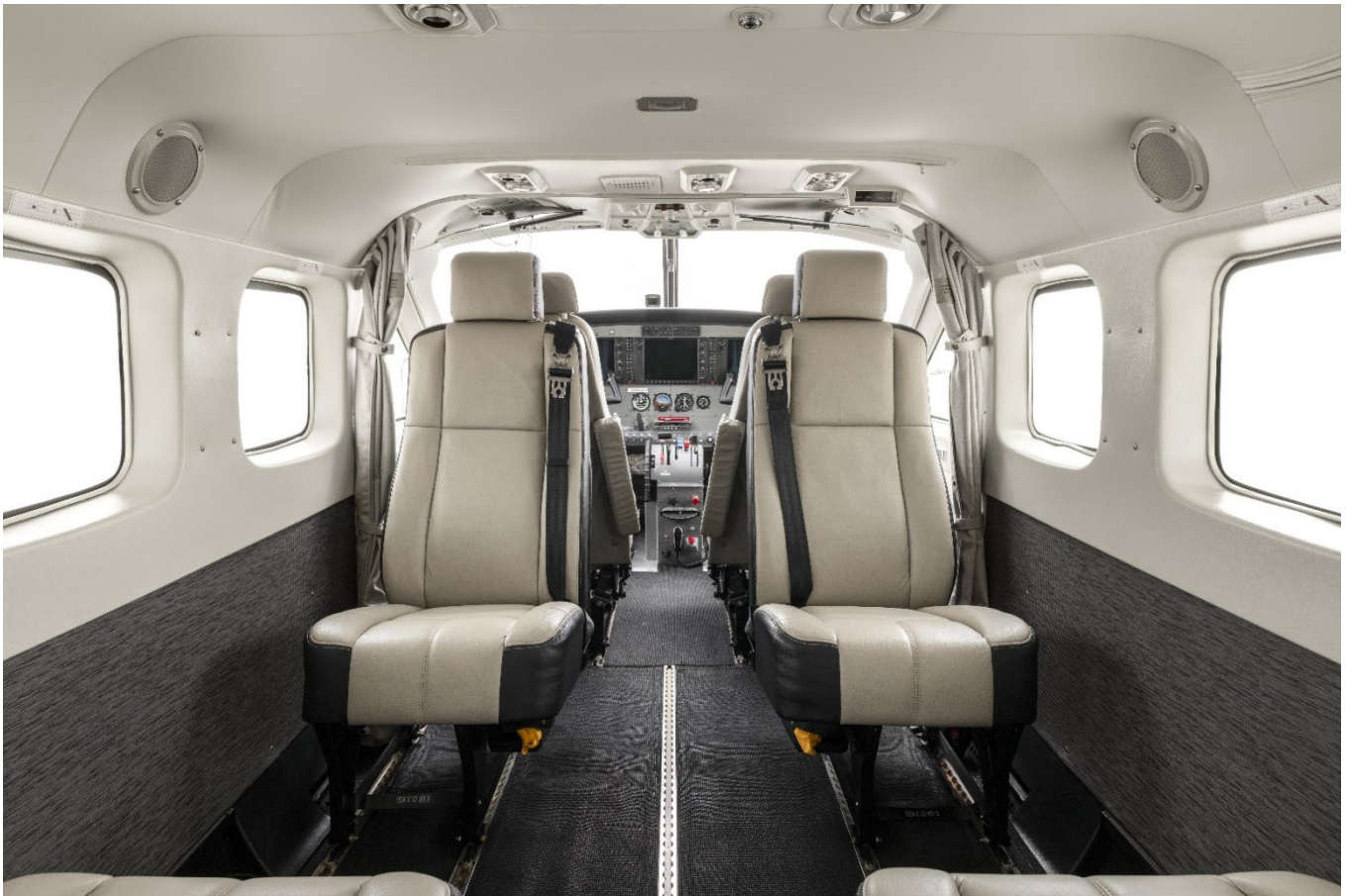
Fwd Cabin Looking Fwd

Click Here to View the Virtual 3D Matterport