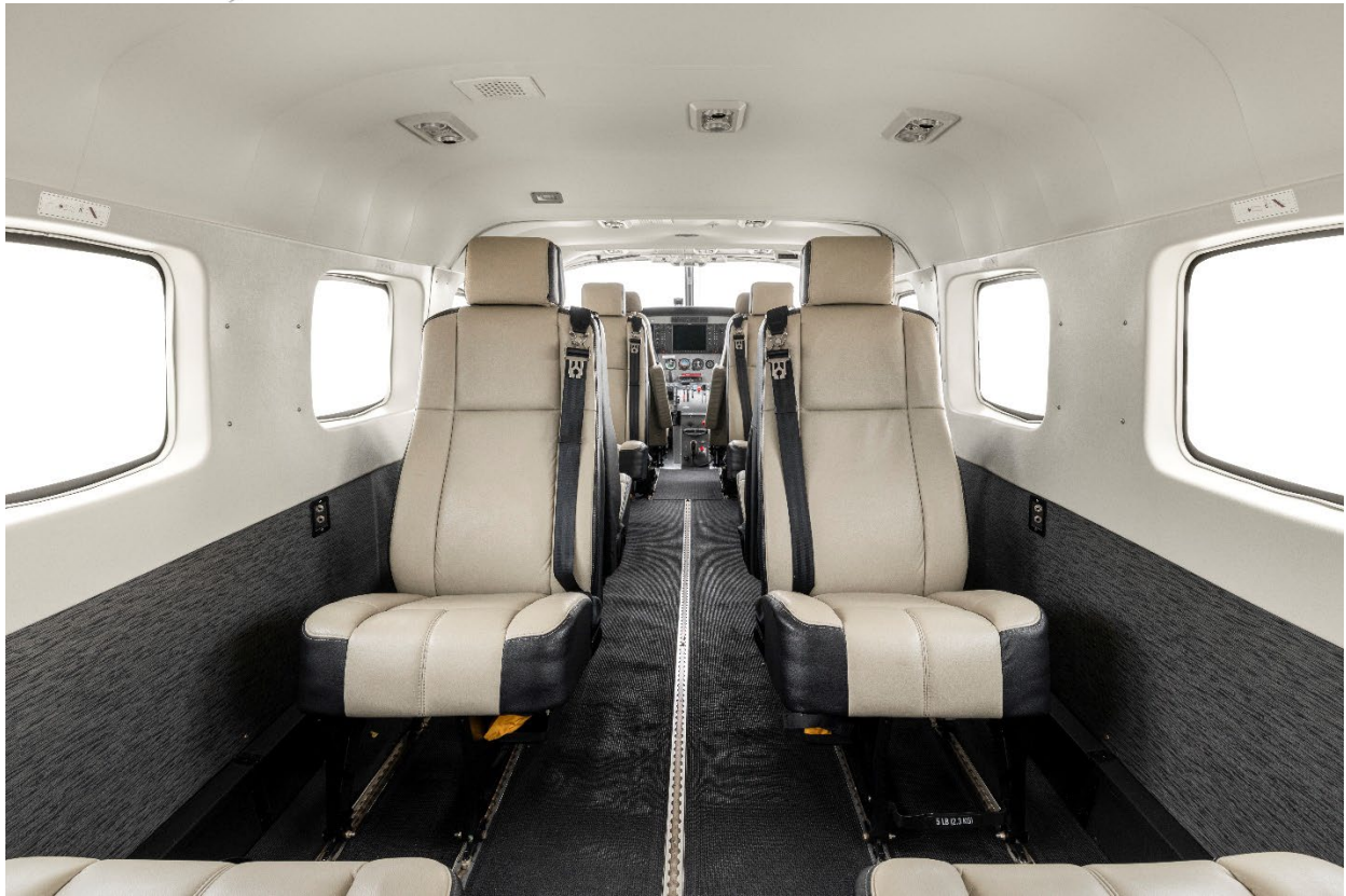
Aft Cabin Looking Fwd