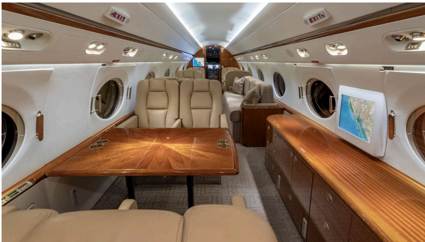
Aft-Cabin Looking Forward