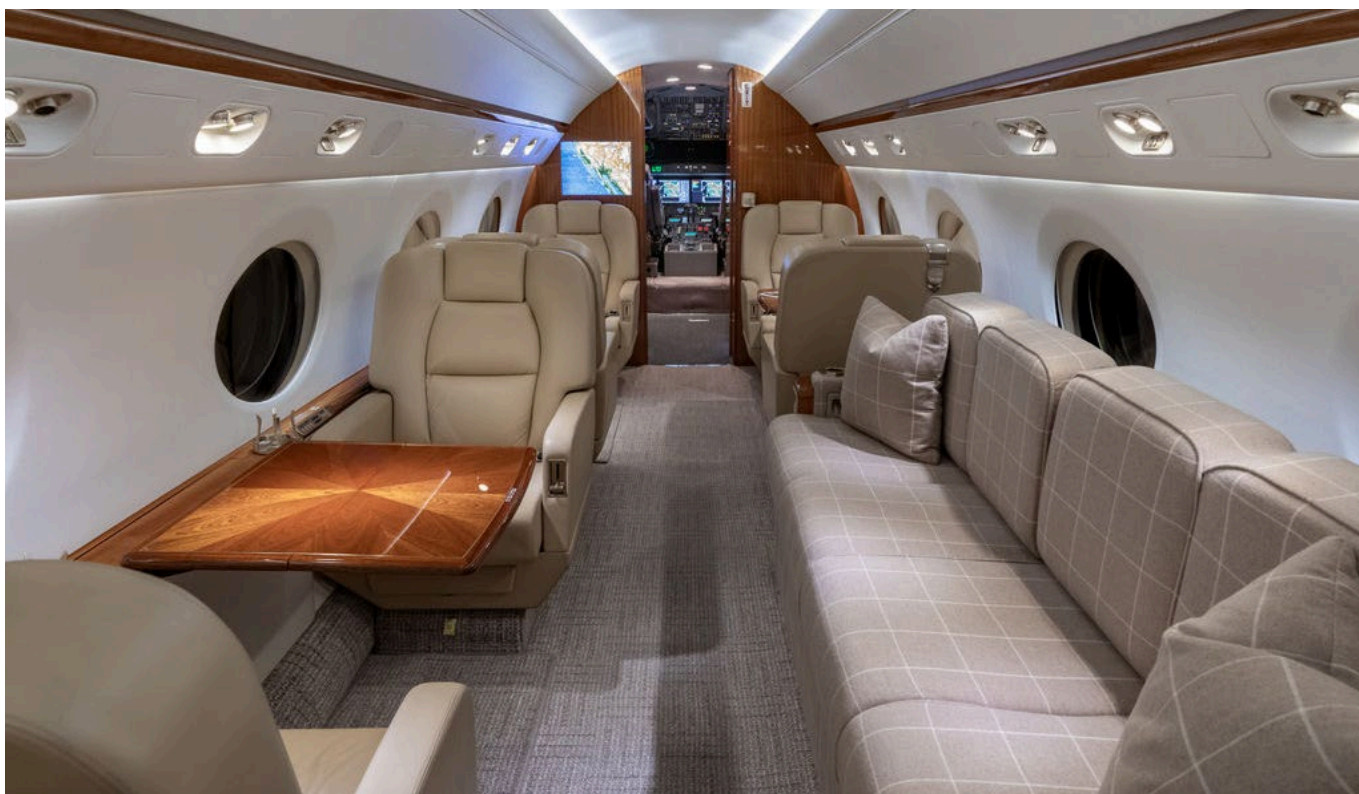
Mid-Cabin Looking Forward