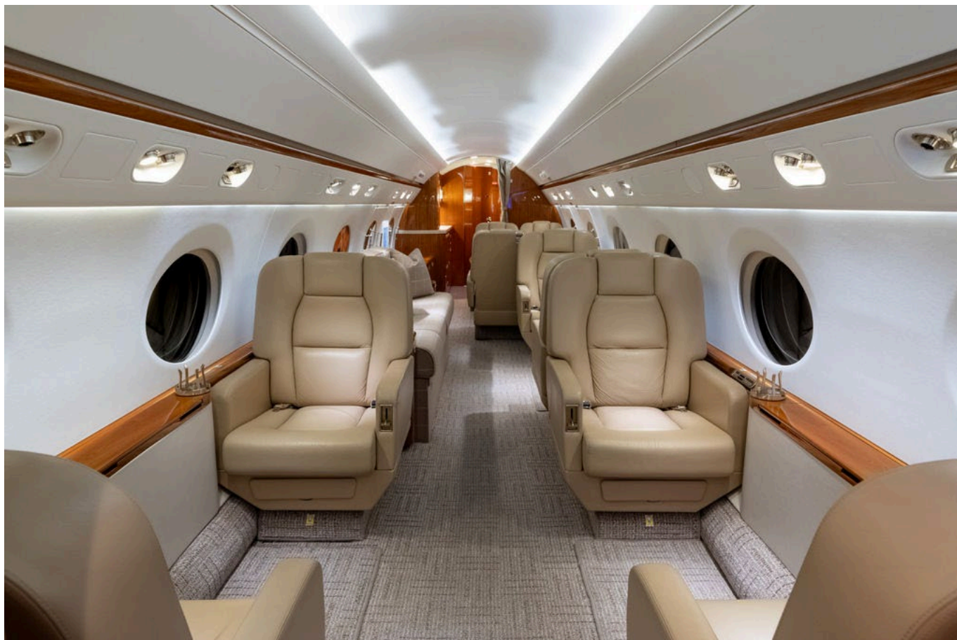
Forward-Cabin Looking Aft

This beautiful 14 passenger configuration features a forward four-place club, followed by a mid-cabin 4-place couch opposite two club seats, and an aft 4-place conference group opposite a credenza. The aft galley features a high temperature oven, microwave oven, coffeemaker and sink.