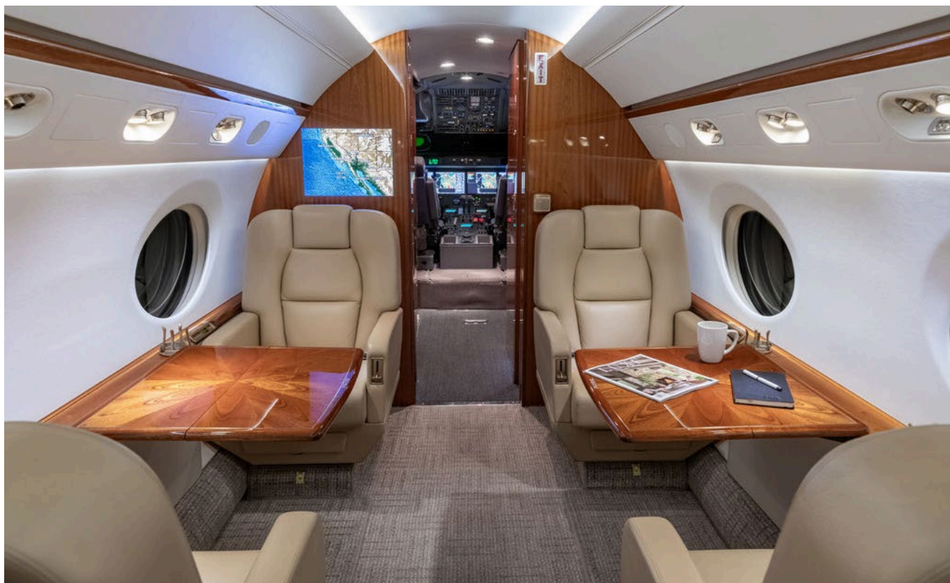
Forward-Cabin Looking Forward