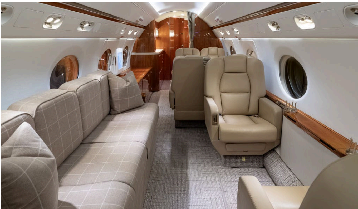
Mid-Cabin Looking Aft