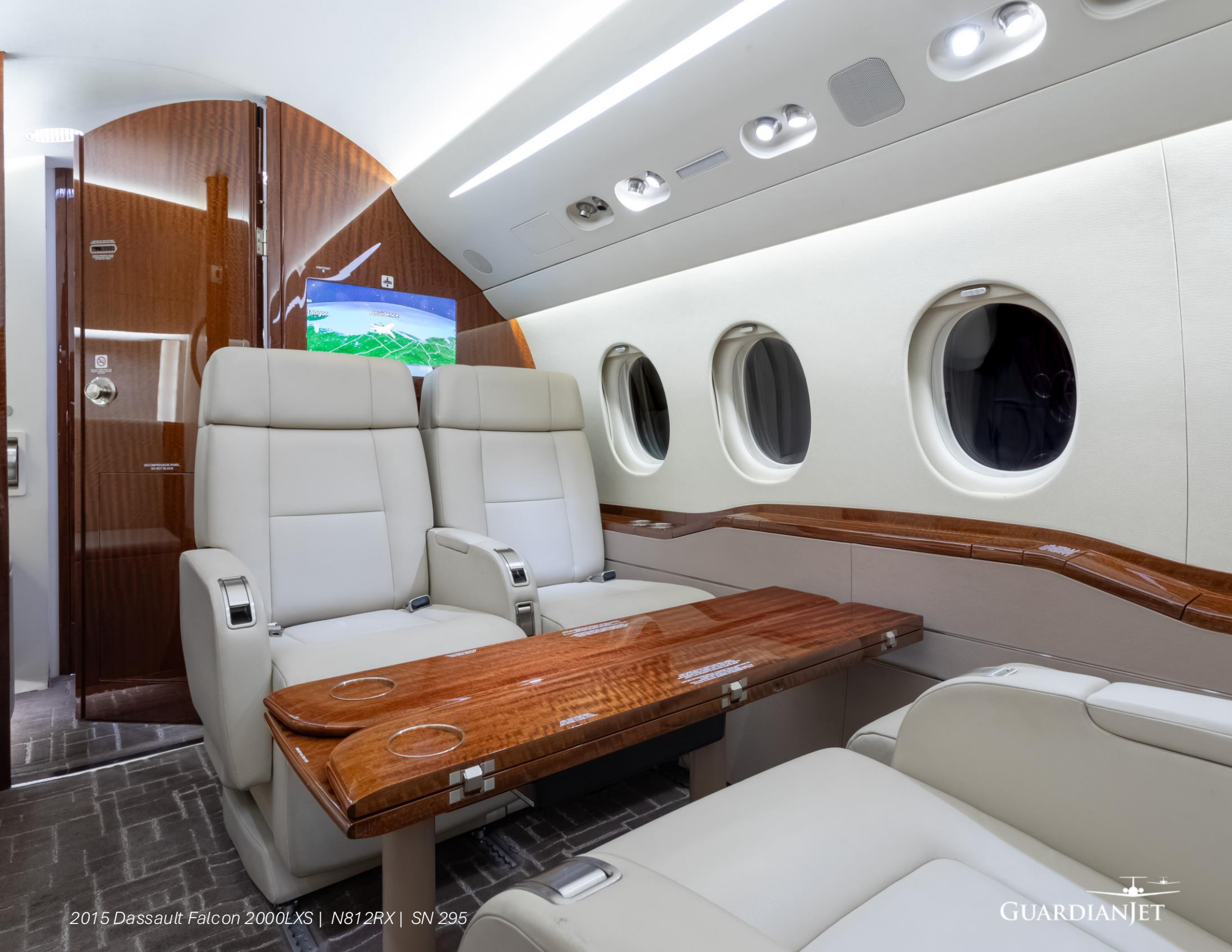
2015 Dassault Falcon 2000LXS | N812RX | SN 295