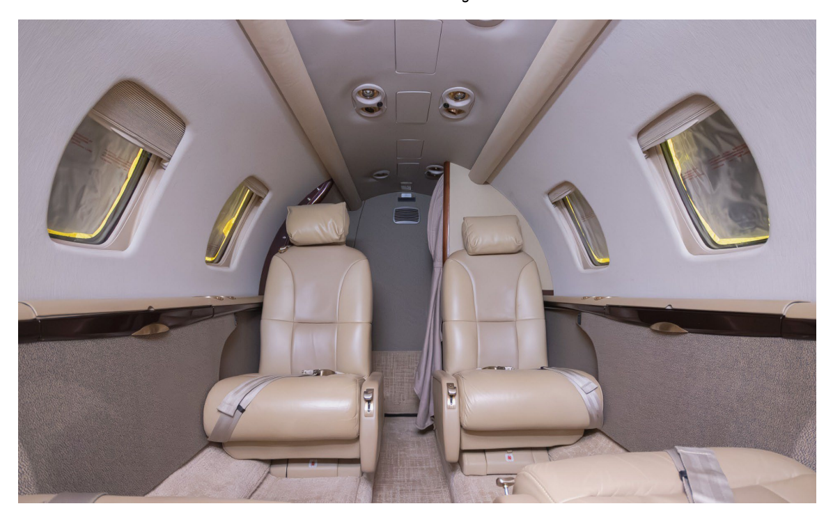
Mid Cabin looking Aft