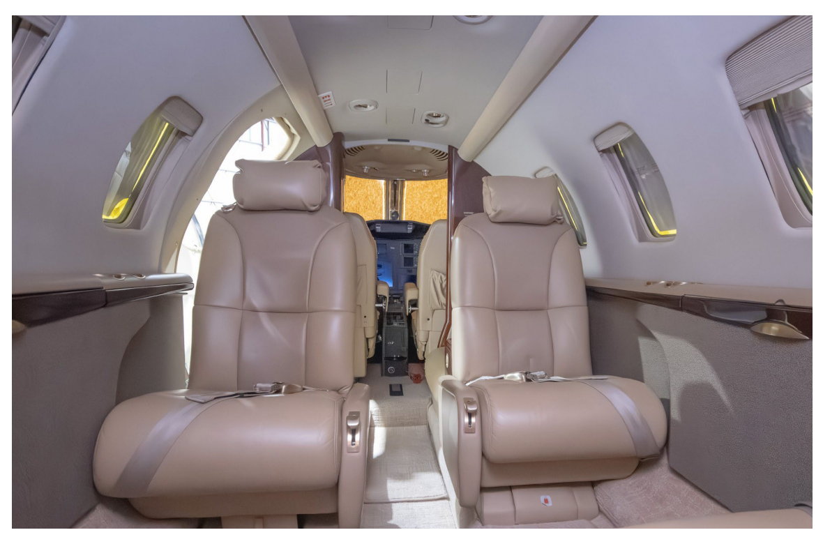
Mid Cabin looking Fwd