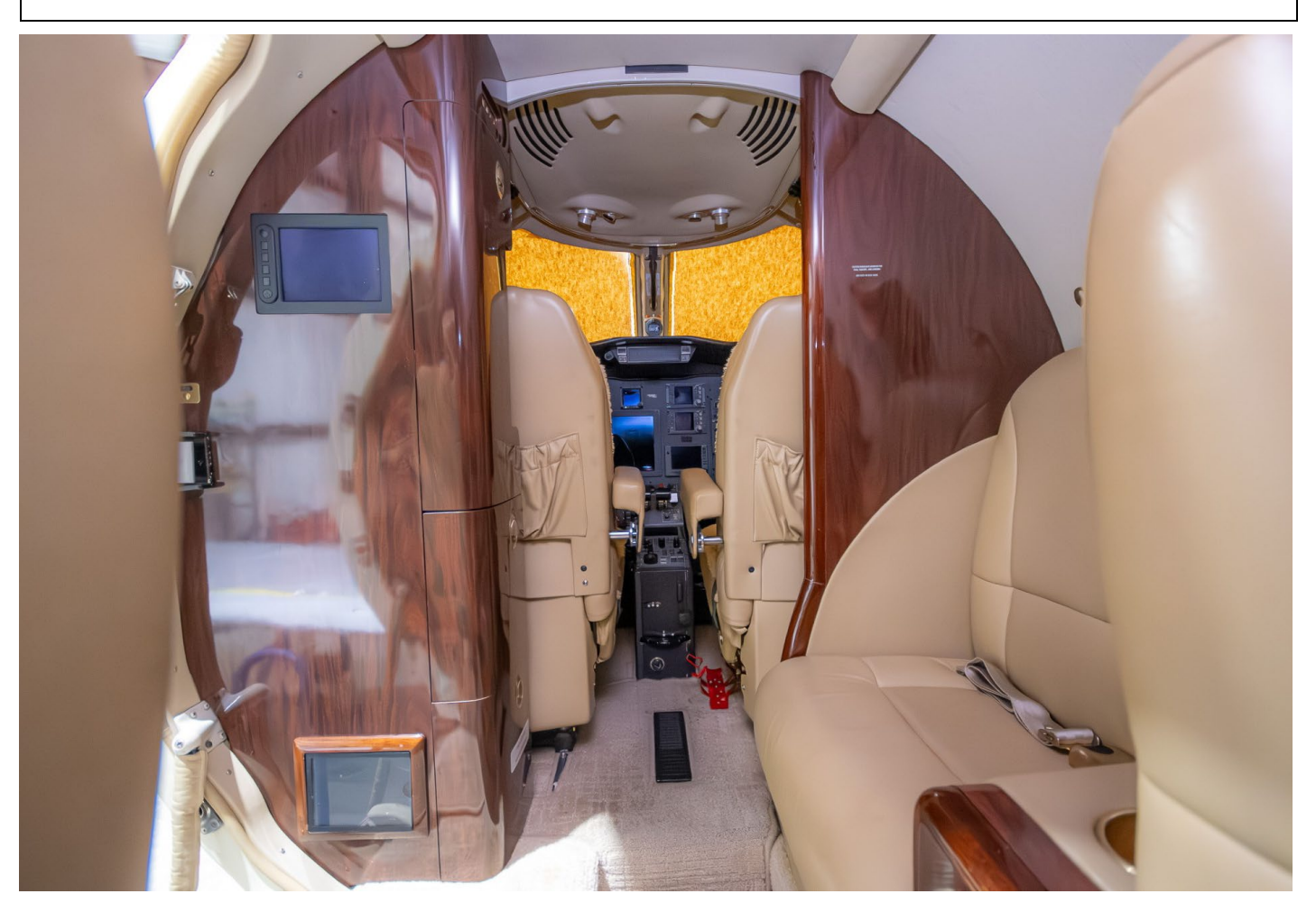
Fwd Cabin looking Forward

A Classic CJ1+ seating configuration featuring a side-facing seat across the main entrance door, followed by a four-place club, and an aft belted lavatory.