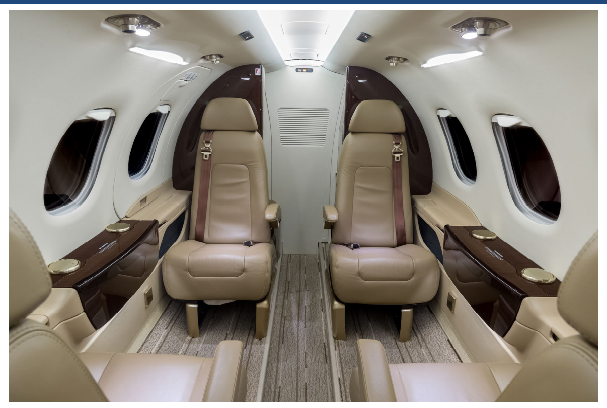
Cabin looking Aft