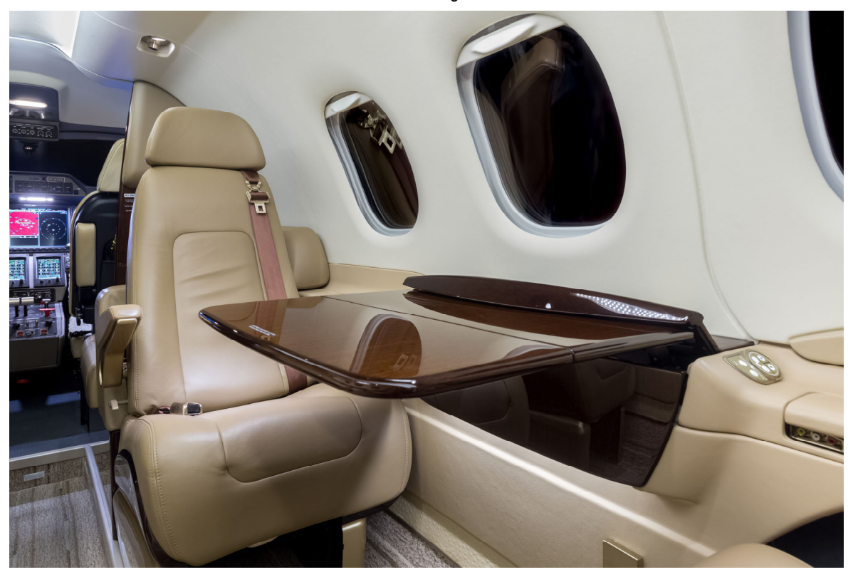
Forward Seat Looking Aft