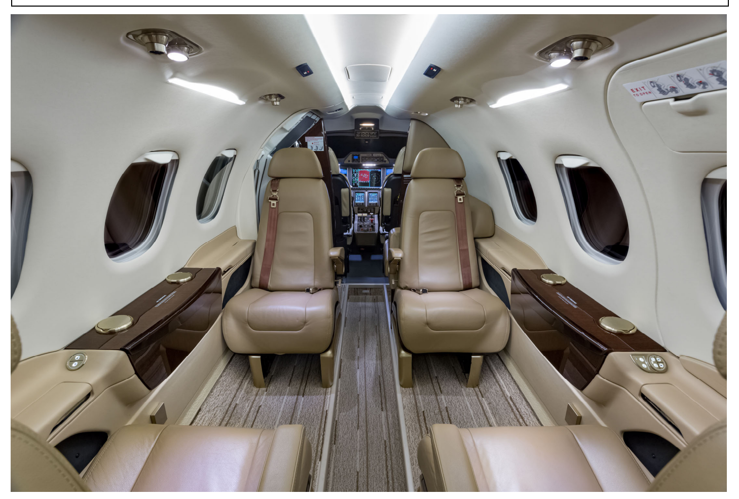
Cabin looking Forward

The interior features a well adaptable cabin with seating for up to (6) six passengers. The main cabin is configured with a forward side facing seat followed by a four-place club featuring premium seats with retractable arm rests. The aft cabin area is separated by a solid pocket door and comprises a refreshment center with ample storage for food and beverages and a belted lavatory seat.