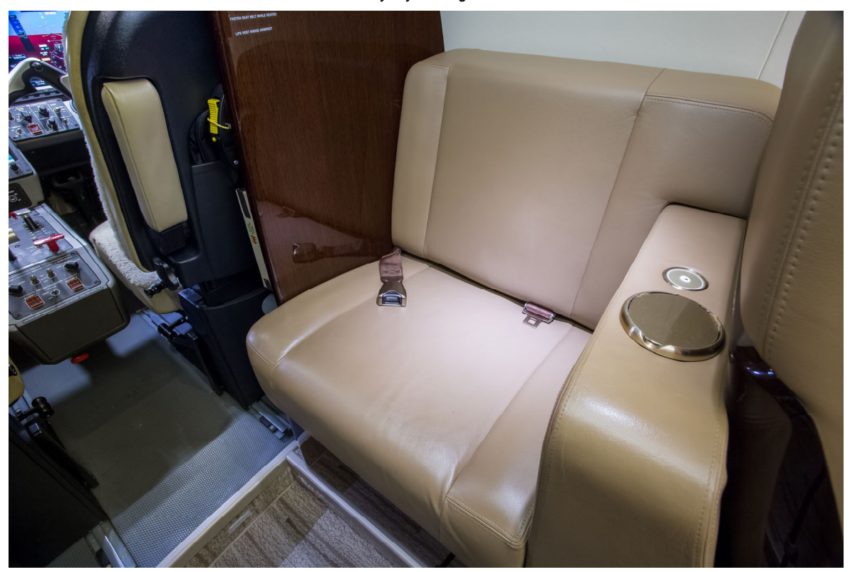
Forward Side Facing Single Divan