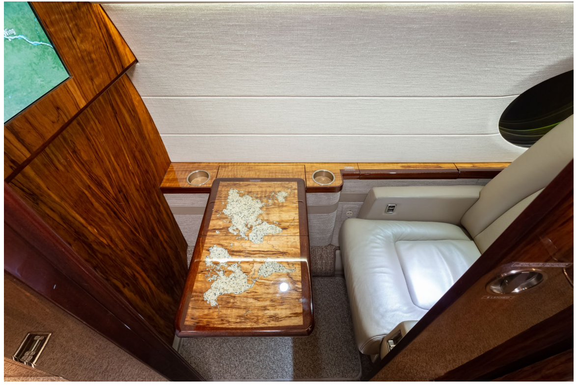
Forward Crew Rest