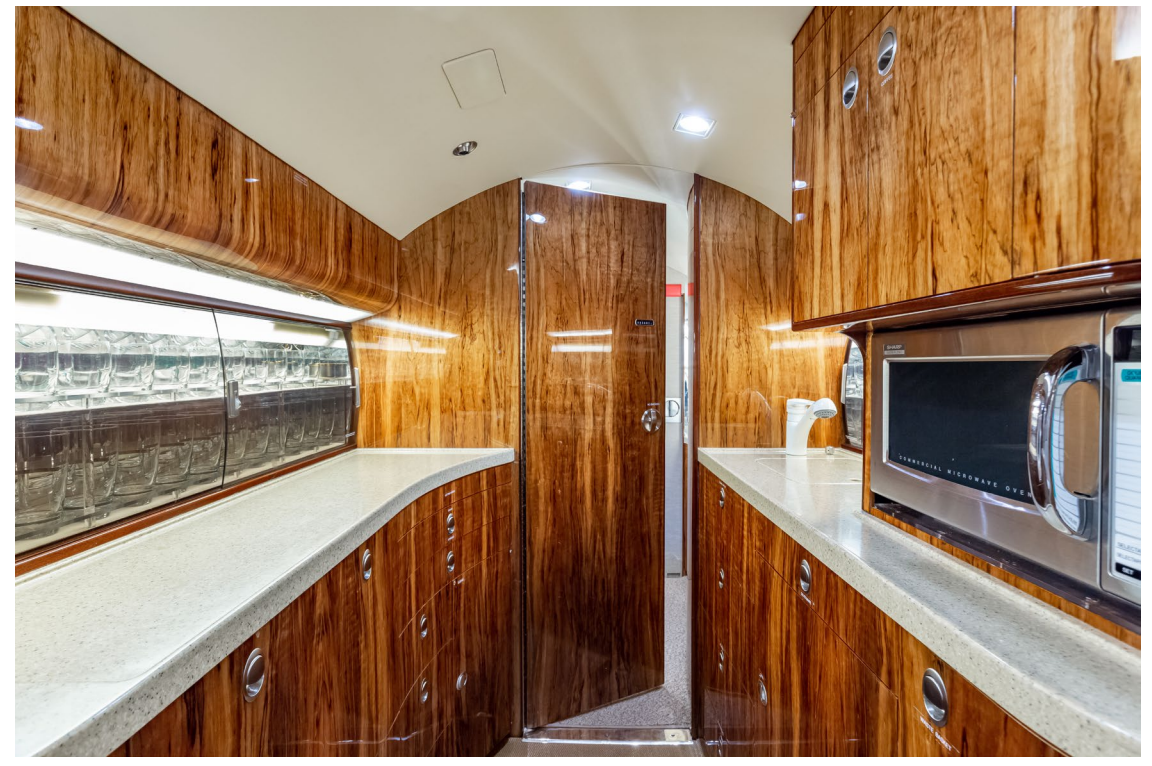
Aft Galley Looking Forward