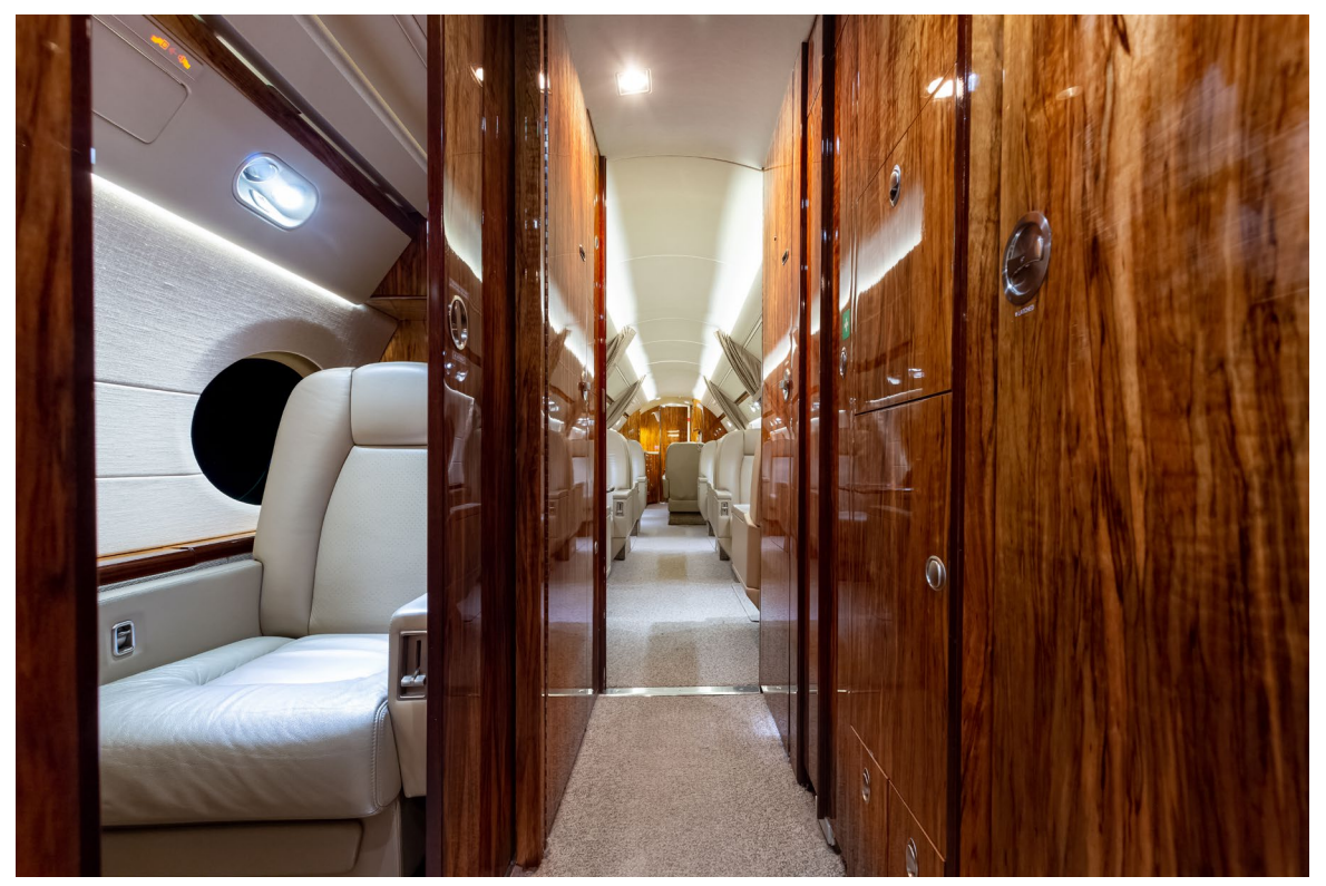
Forward Crew Lavatory & Lavatory