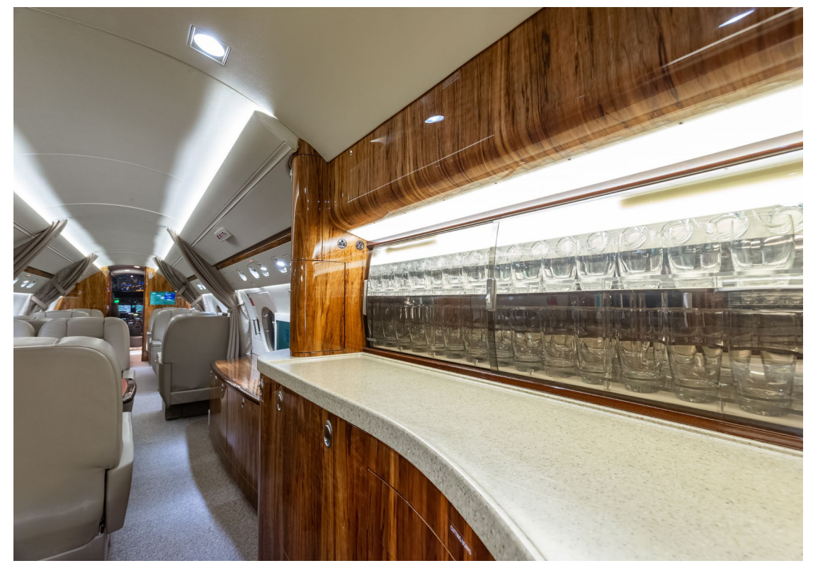
Aft Galley Looking Forward