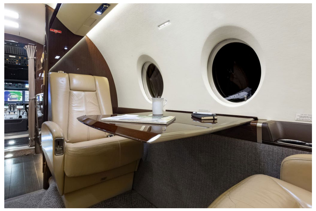
Fwd Cabin looking left