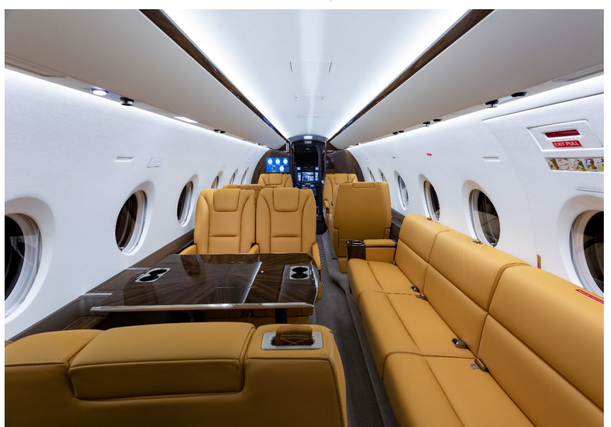
Aft Conference Group looking Forward