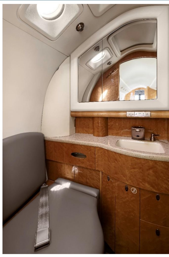
Forward Galley Aft Lavatory