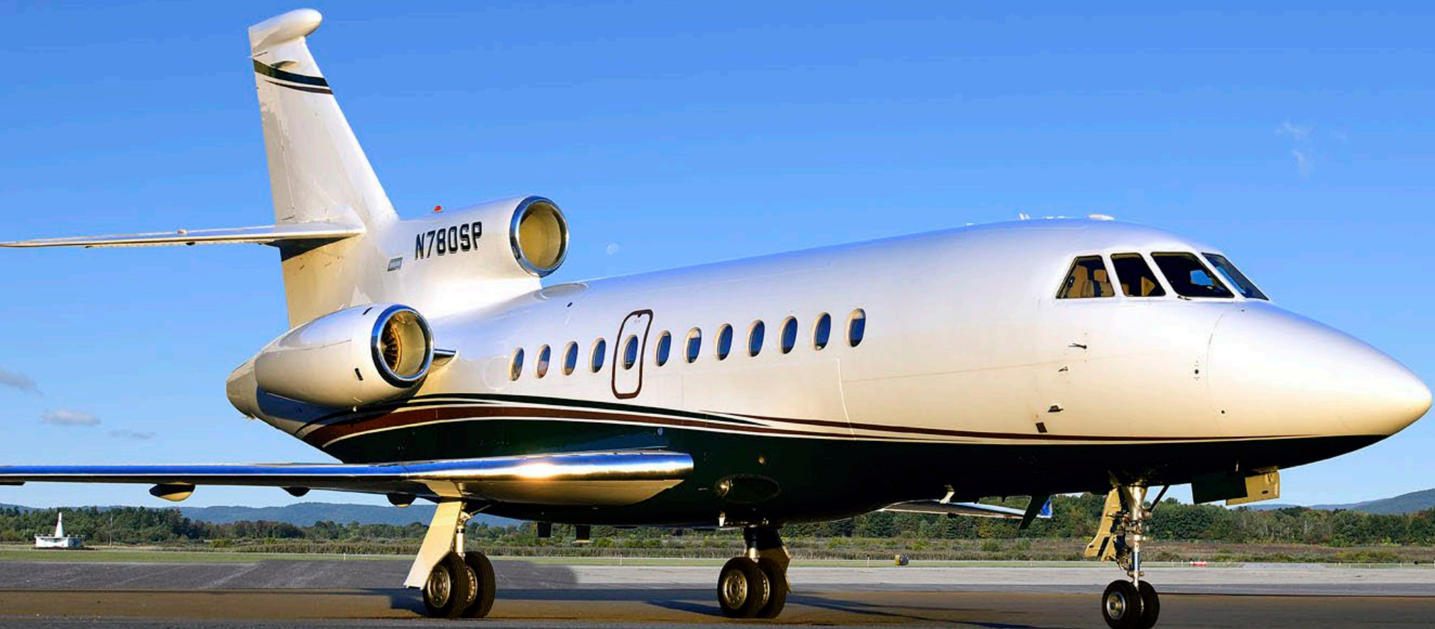
1991 Dassault Falcon 900B | N780SP | SN 93