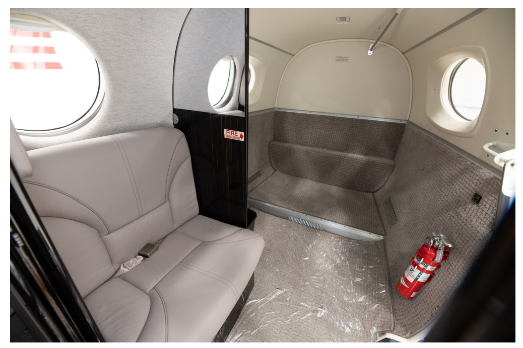
Aft Belted Lav & Baggage Compartment