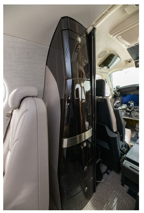
Forward Refreshment Center