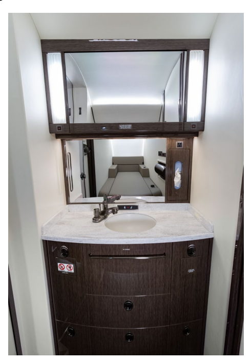
Vanity / Aft Lavatory