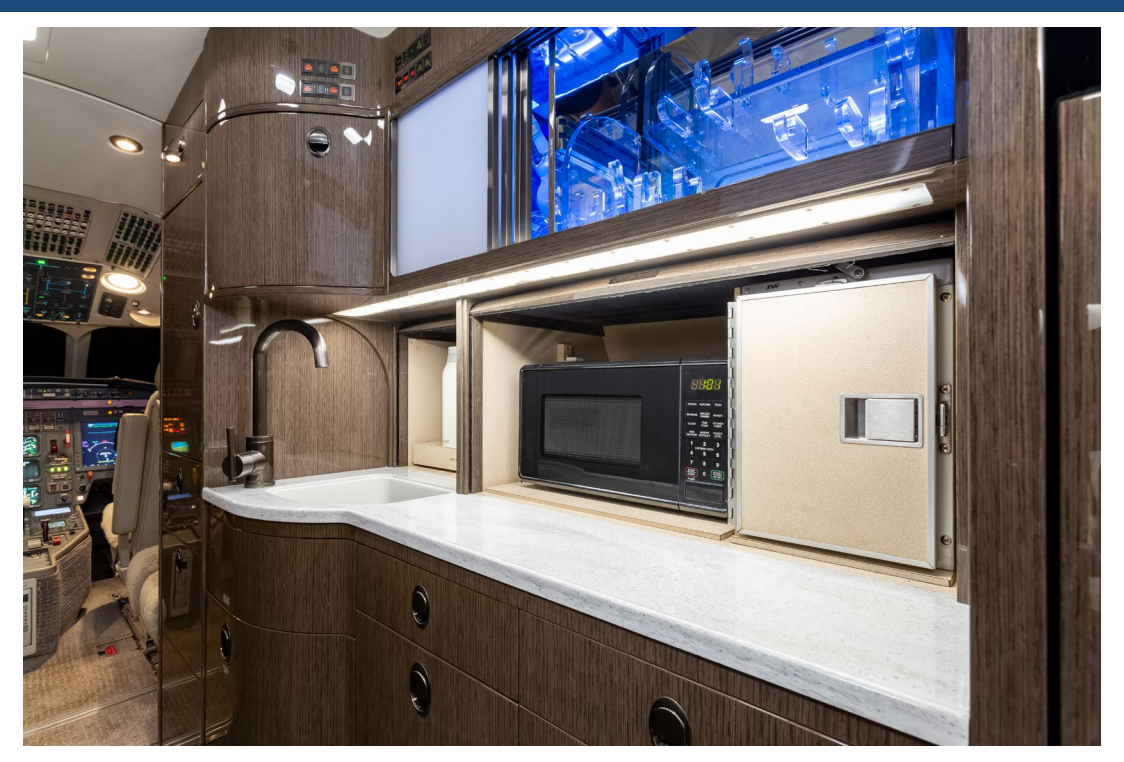
Forward Galley looking Aft