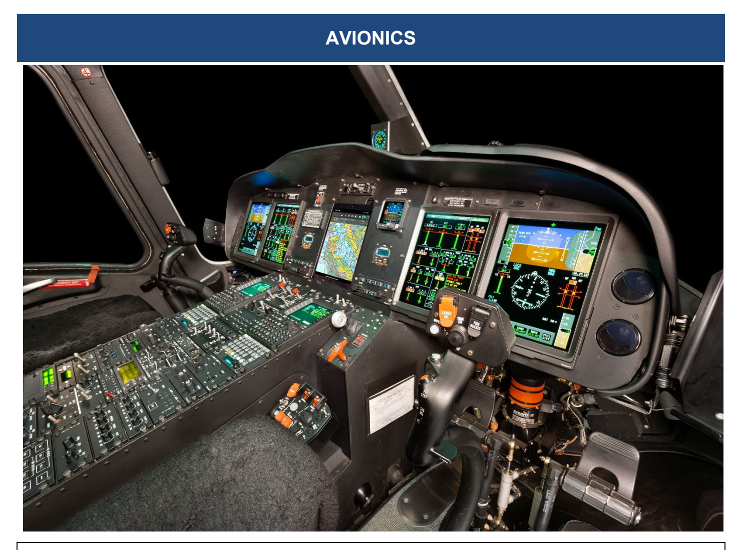
AVIONICS: Honeywell Primus Phase 7

AIR DATA COMPUTERS: Honeywell R/R ADM COCKPIT VOICE RECORDER: Penny & Giles Multi Purpose Flight Recorder (w/ ULB) COMMUNICATIONS: AV-900 Audio Panel DISPLAY UNITS: Honeywell DU-1080-3 DISTANCE MEASURING EQUIPMENT: Dual Honeywell DM-855 ENHANCED GROUND PROXIMITY WARNING SYSTEM: MK XXII EMERGENCY LOCATOR TRANSMITTER FLIGHT DATA RECORDER FLIGHT MANAGEMENT SYSTEM GLOBAL POSITIONING SYSTEM: SBAS SATELLITE COMM: Skytrac ISAT 200 TRANSPONDERS: Dual Honeywell XS-858B TRAFFIC COLLISION ALERT AVOIDANCE SYSTEM: BendixKing KTA-910 WEATHER RADAR: Honeywell Primus 660