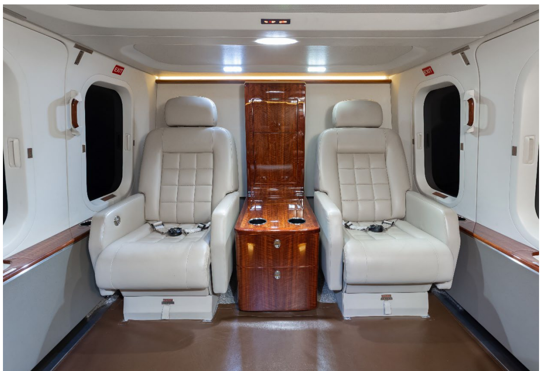
FWD facing seats