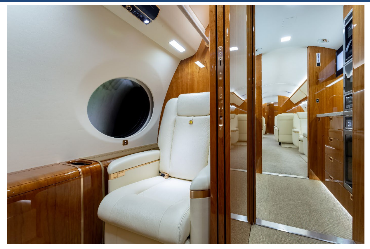
Forward Crew Rest