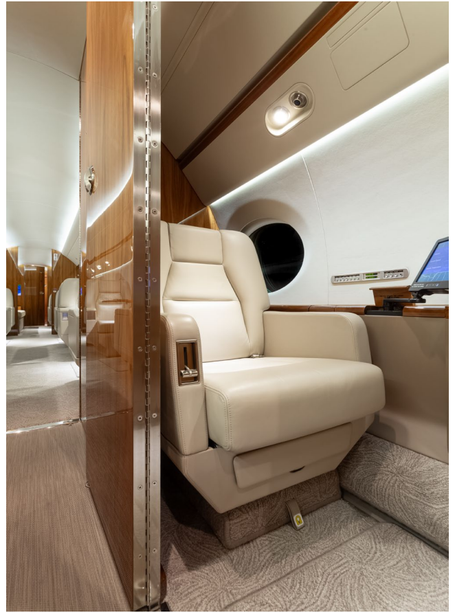
Forward Crew Rest