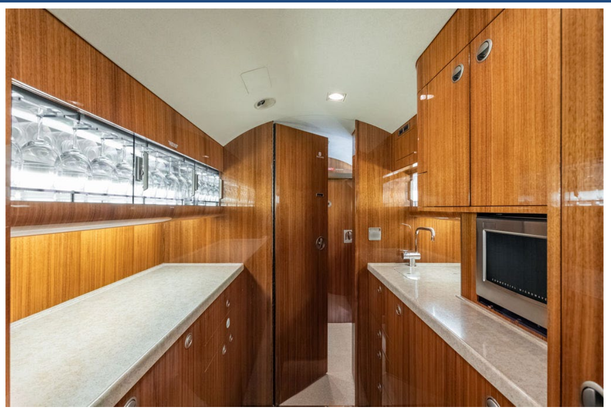
Aft Galley Looking Aft