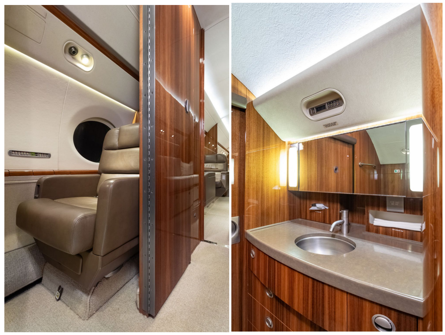
Forward Crew Rest