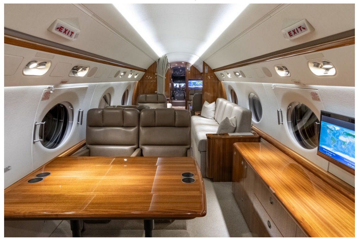
Aft Cabin looking Forward