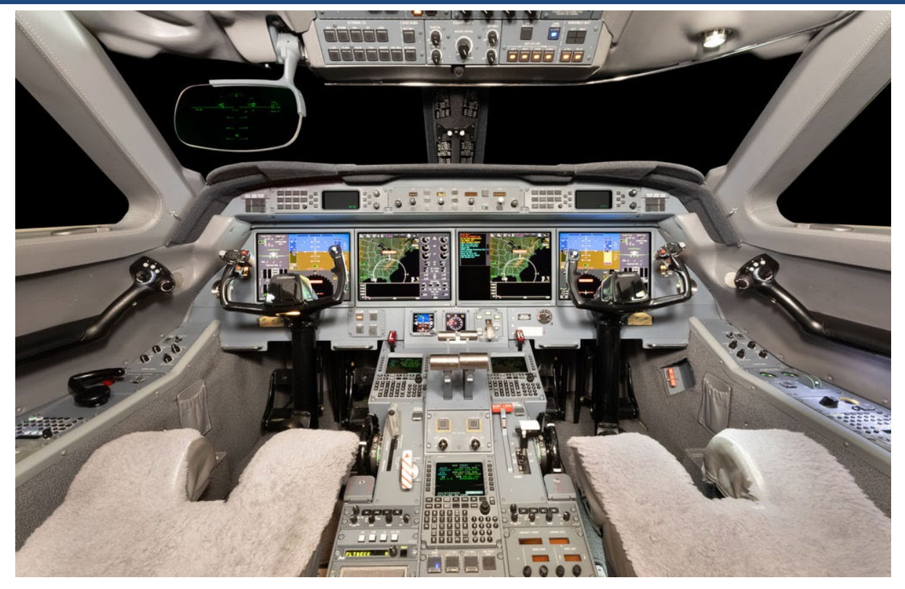
AVIONICS Honeywell Primus Epic Planeview

AIR DATA COMPUTER: Triple Honeywell AZ-200 Air Data Modules AUTOMATIC DIRECTION FINDER: Dual Honeywell DF-855 ADF AUTO THROTTLES: Honeywell Auto Throttle System AUTOPILOT / FLIGHT DIRECTOR: Honeywell Planeview System COCKPIT VOICE RECORDER: Universal CVR-120R Cockpit Voice Recorder (120 minutes) COMMUNICATIONS: Dual Honevwell TR-865A and Third Honevwell Comm Modules DISTANCE MEASURING EQUIPMENT: Dual Honeywell DM-855 Distance Measuring Equipment ELECTRONIC FLIGHT INFORMATION SYSTEMS: Honeywell Planeview – 4 Display EFIS EMERGENCY LOCATOR TRANSMITTER: Artex C-406N Emergency Locator Transmitter ENHANCED VISION SYSTEM: Kollsman EVS System ENHANCED GROUND PROXIMITY WARNING SYSTEM: Dual Honeywell EGPWM-100 Modules FLIGHT DATA RECORDER: Universal FDR-25 Flight Data Recorder FLIGHT MANAGEMENT SYSTEM: Triple Honeywell Planeview System GLOBAL POSITIONING SYSTEM: Dual Honeywell GPS Modules with WAAS HIGH FREQUENCY: Dual Rockwell Collins HF-9034A HF Comm Radios HEADS UP DISPLAY: Collins VGS System with EVS LONG RANGE NAVIGATION: Triple Honeywell Laseref V IRUs NAVIGATION: Dual Honeywell NV-875A Nav Radios with VOR, ILS, and Datalink RADIO ALTIMETER: Dual Honeywell KRA-405B Radio Altimeters TRAFFIC COLLISION AVOIDANCE SYSTEM: ACSS TCAS 3000SP with Change 7.1 TRANSPONDER: Dual Honeywell XS-858B Mode S Transponders with ADS-B Out Version 2 WEATHER RADAR: Honeywell Primus WU-880 Color Weather Radar