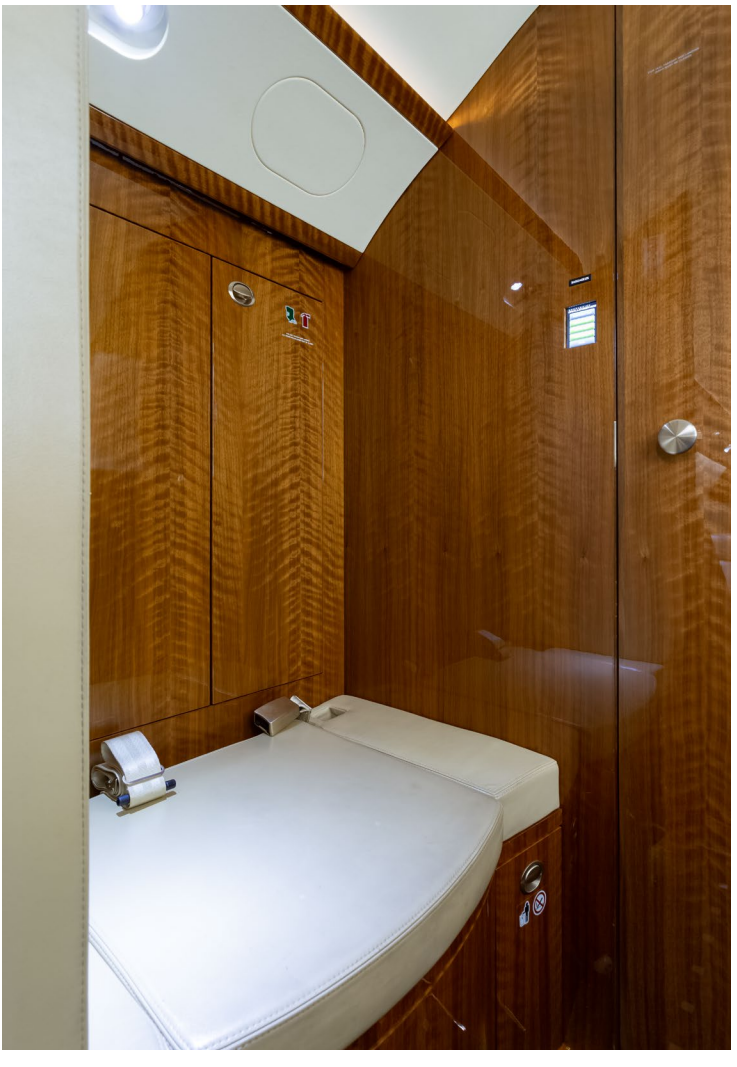
Forward Galley Aft Lavatory