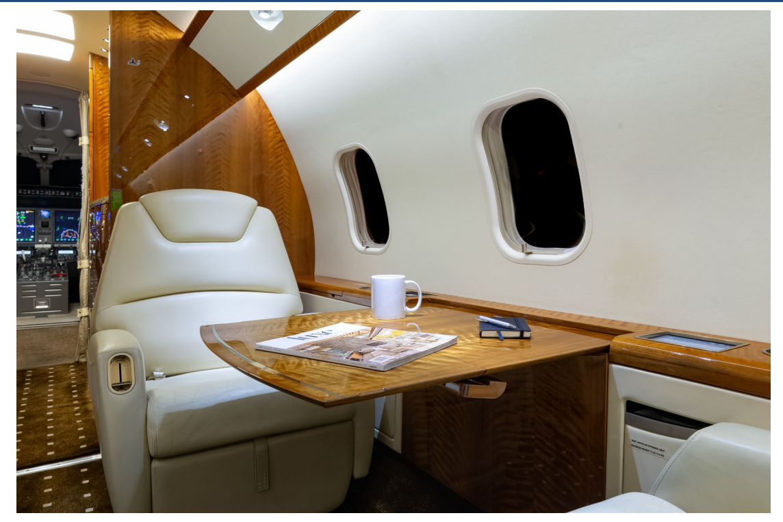
Right-Hand Forward Facing Seat