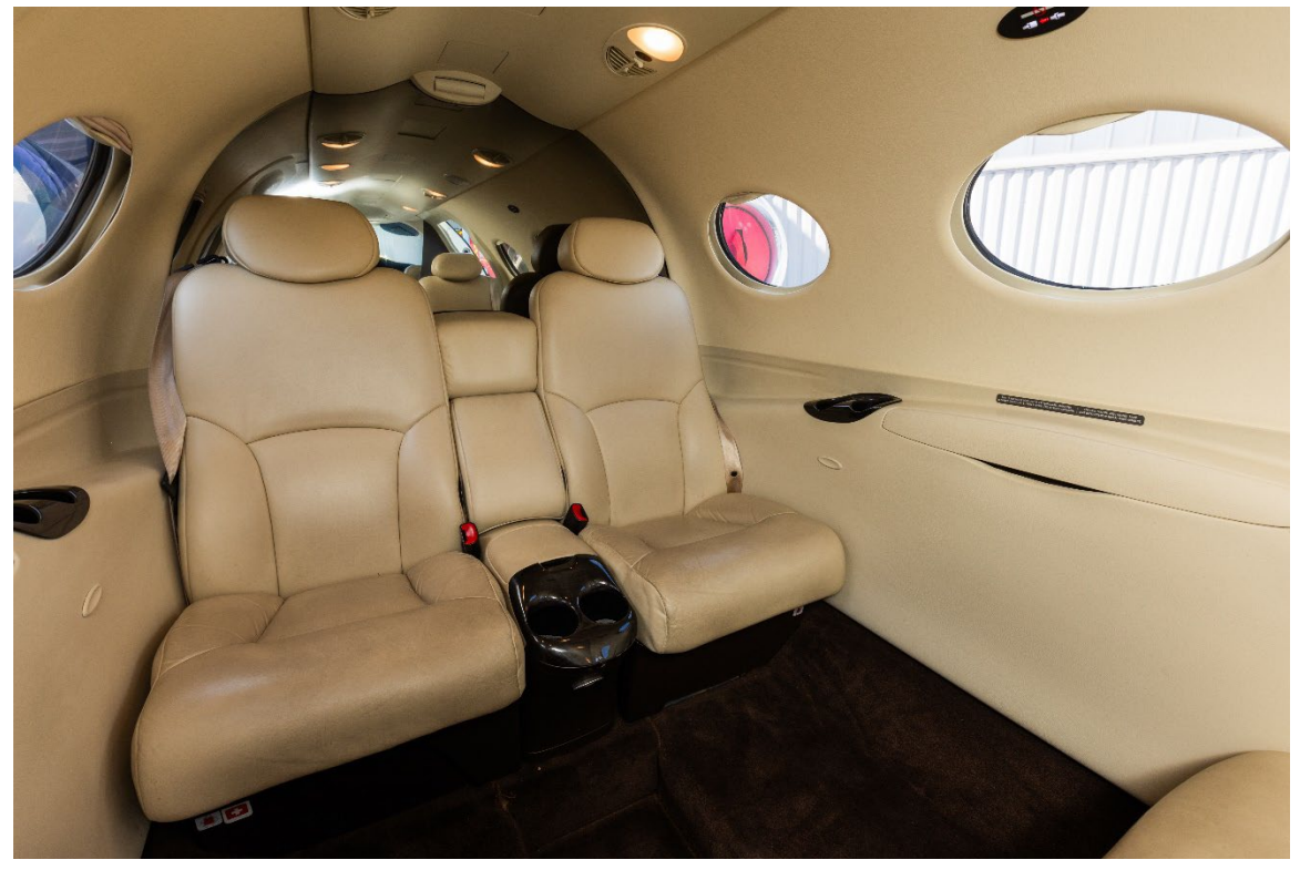
Cabin Looking Aft