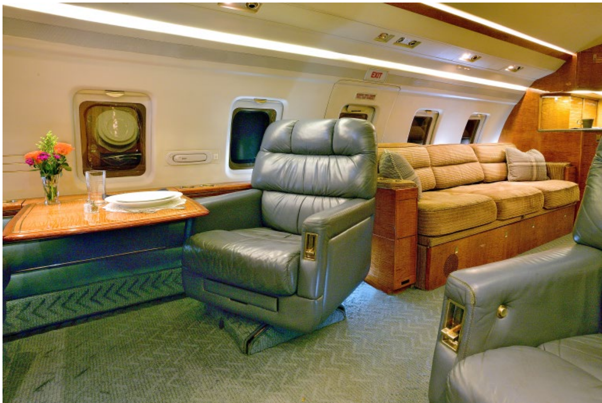
Right Hand Seat Facing Forward