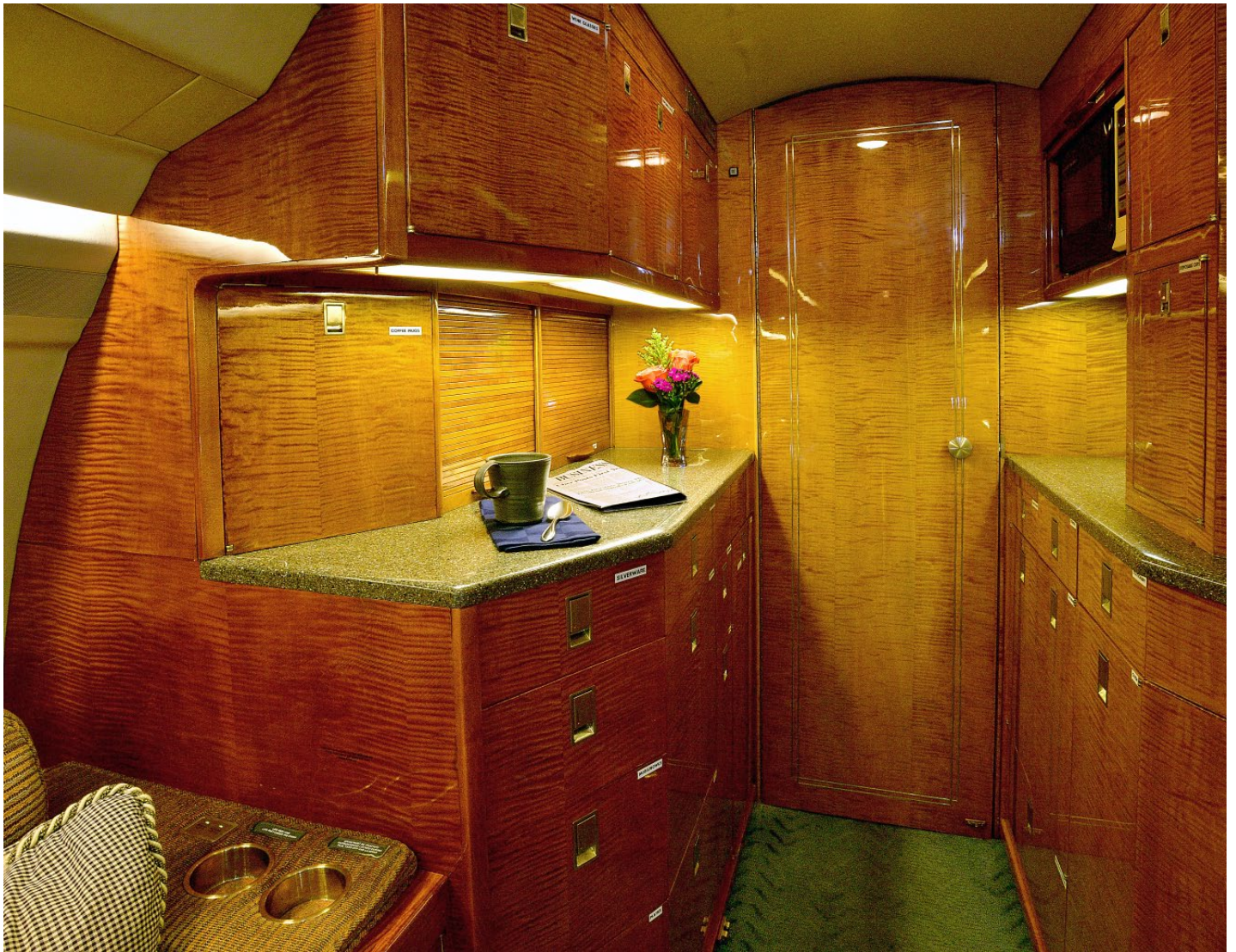
Aft Galley looking aft