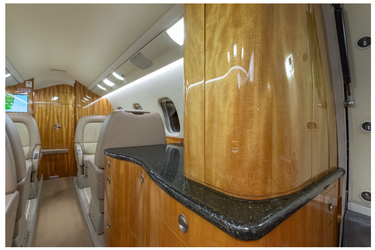
Forward Refreshment Center

102A BROAD STREET • GUILFORD • CONNECTICUT • 06437 • 203-453-0800 • WWW.GUARDIANJET.COM