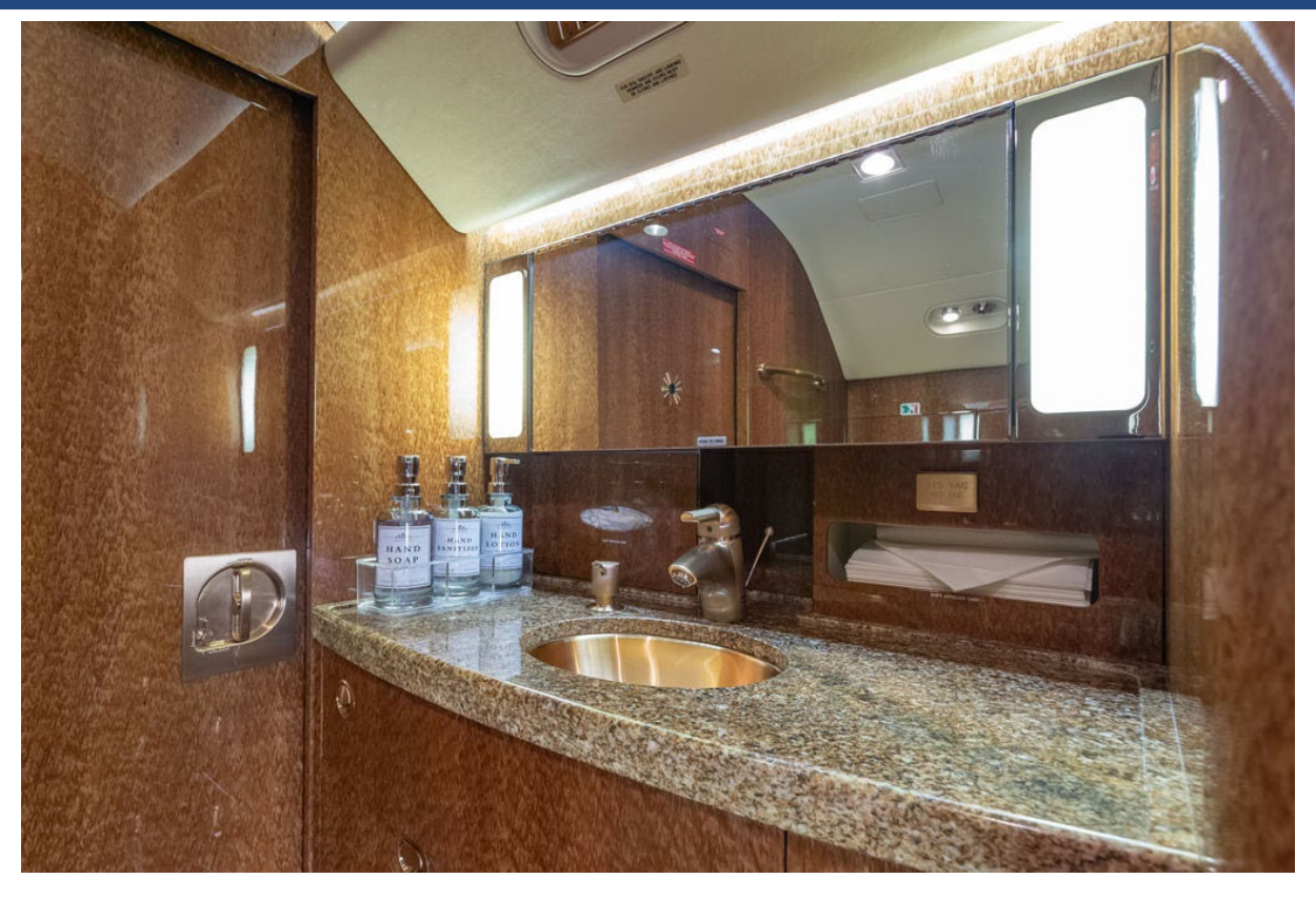
Aft Lav Vanity