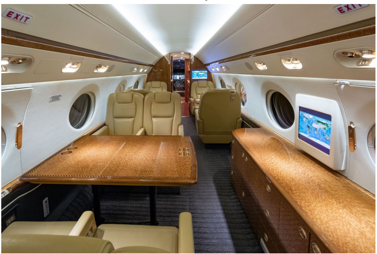
Mid Cabin looking Forward