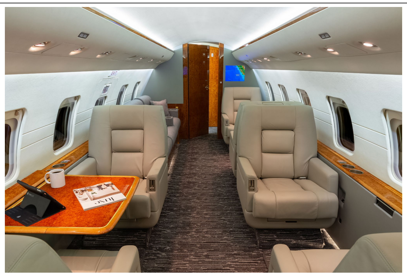
Fwd Cabin Looking Aft

Nine (9) passenger cabin features 4-place forward club, preceding a 2-place club opposite a 3-place divan and a spacious aft lavatory.