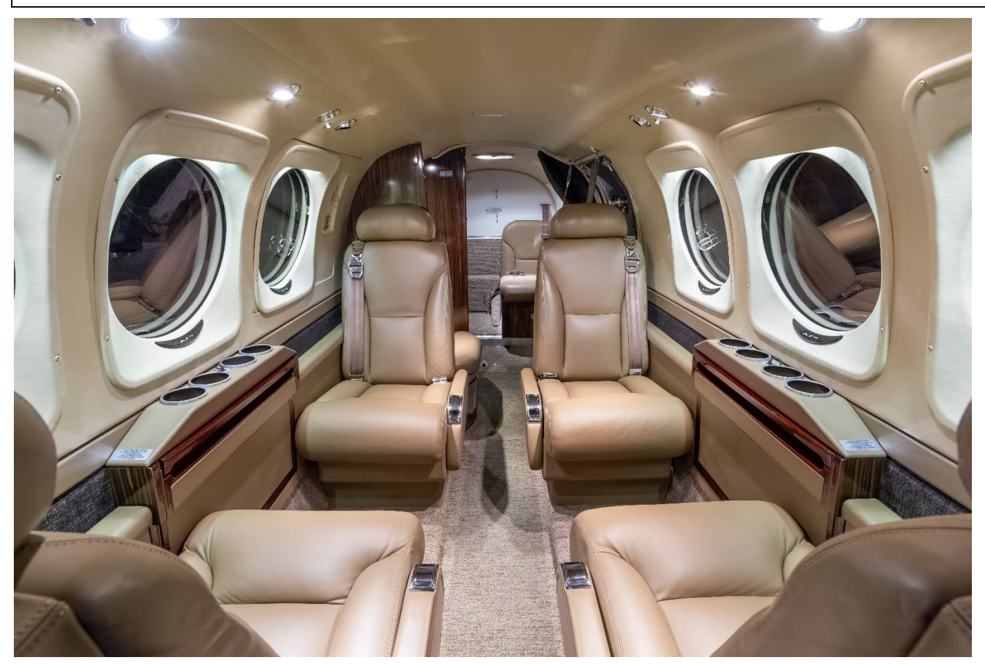
Fwd Cabin looking Aft

Six (6) passenger cabin features a 4-place club with folding tables in the forward cabin. Each chair includes fore/aft travel, swivel/recline capability, and retractable inboard armrest. The aisle facing seat with lap belt includes two ice chest/storage drawers below.