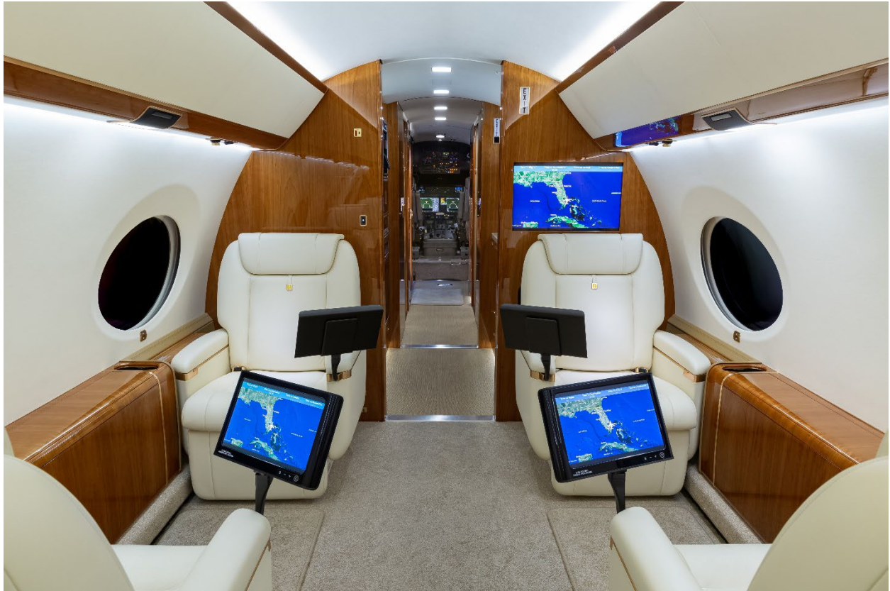
Forward Cabin looking Forward