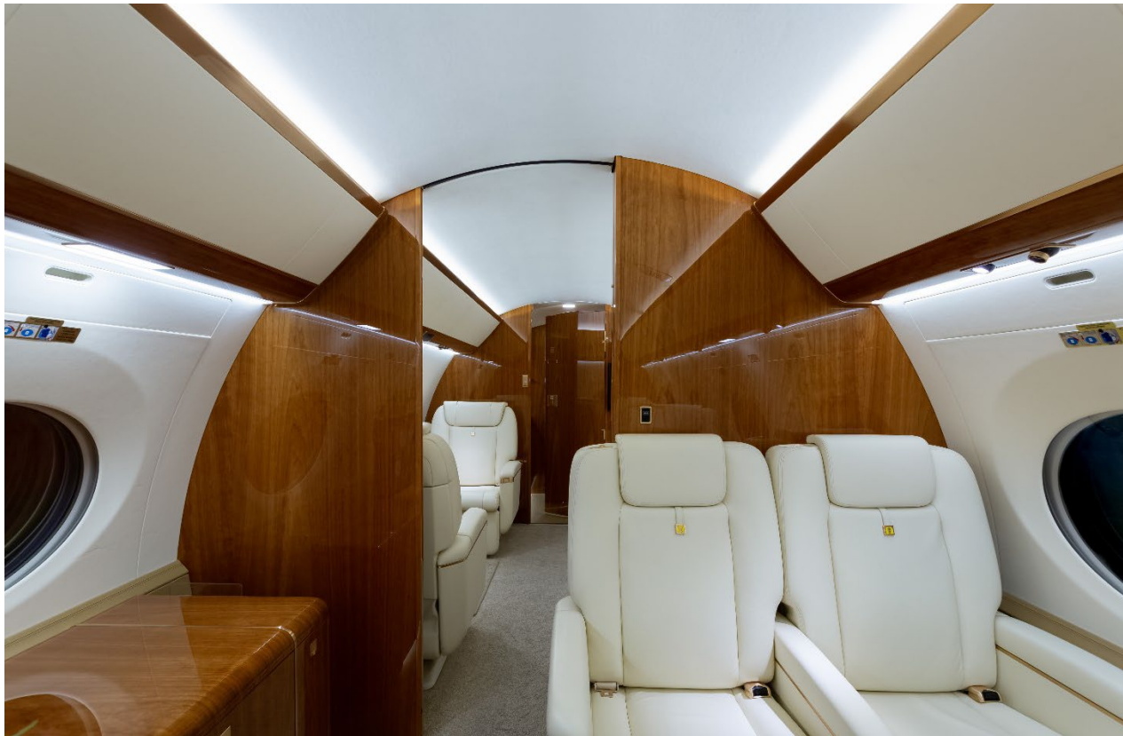
Mid Cabin looking Aft