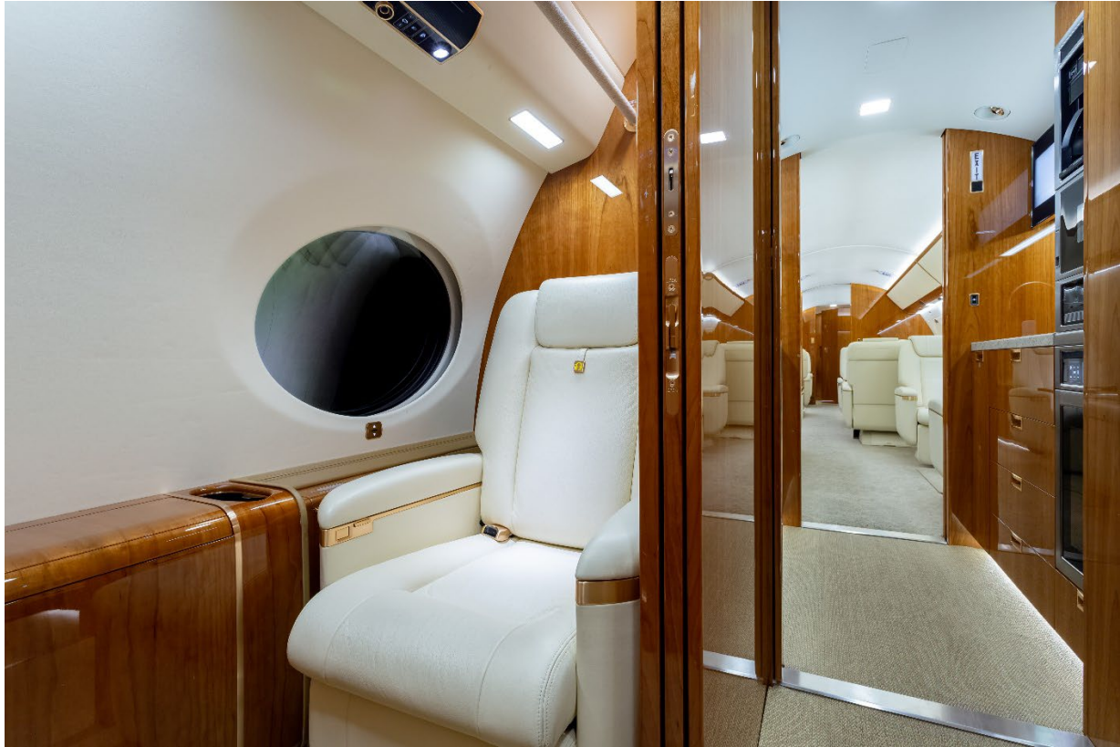
Forward Crew Rest