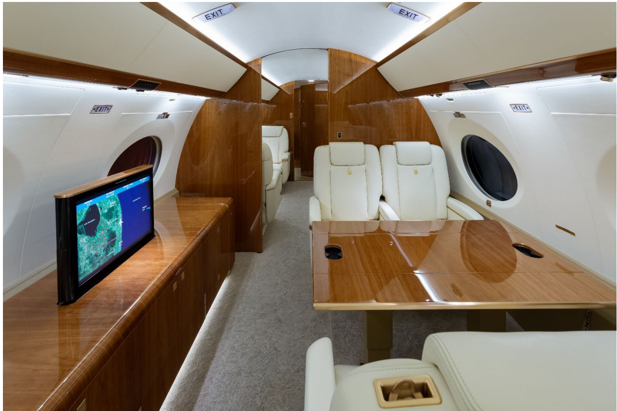
Mid Cabin looking Aft