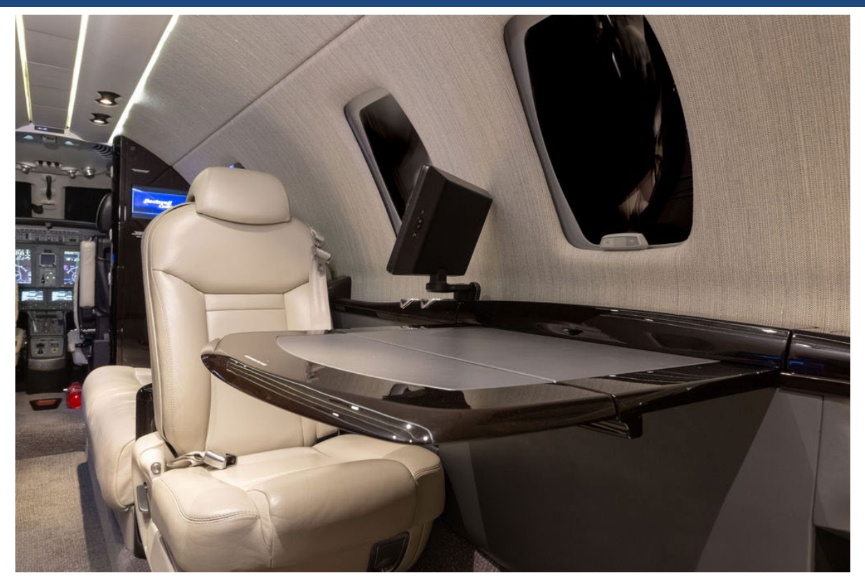
Forward Cabin looking Fwd