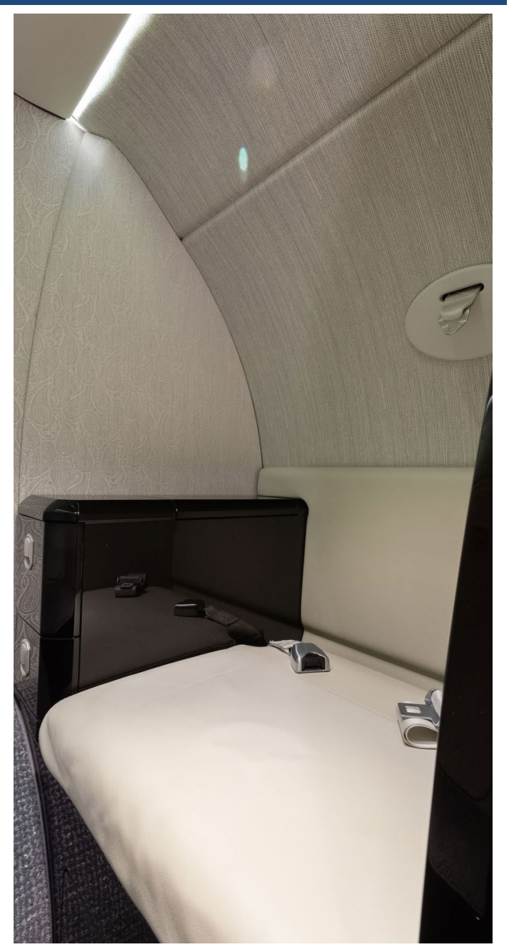
Belted Aft Lavatory