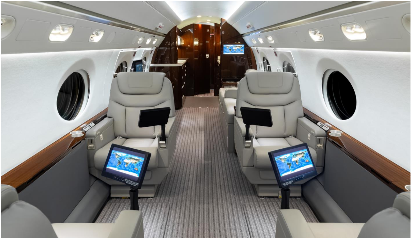
Mid-Cabin Looking Aft