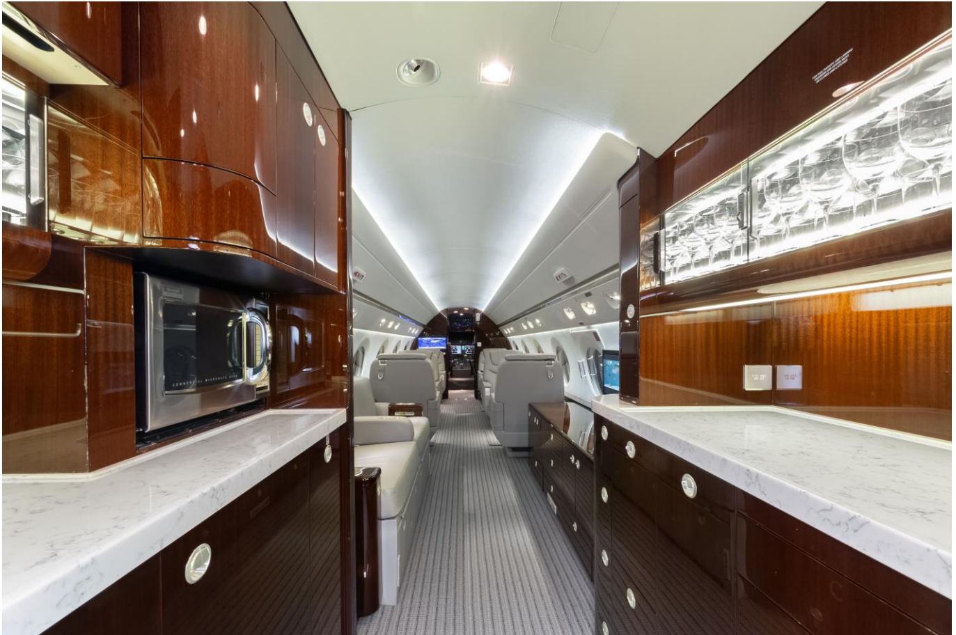
Aft Galley Looking Forward