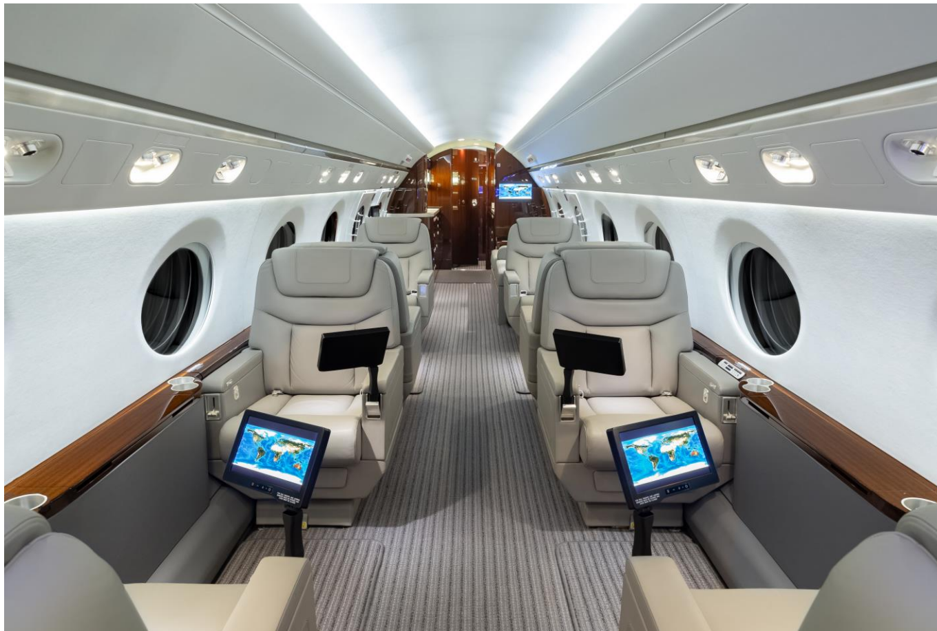
Forward-Cabin Looking Aft

This beautiful 12 passenger configuration features an aft galley, a forward crew lavatory, LED cabin lighting, and enhanced soundproofing. The spacious cabin includes forward four-place club, mid four-place club, and an aft three-place divan opposite a credenza.