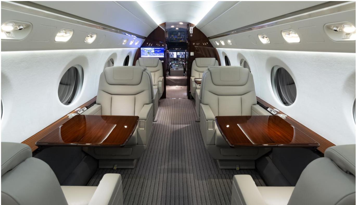
Mid-Cabin Looking Forward