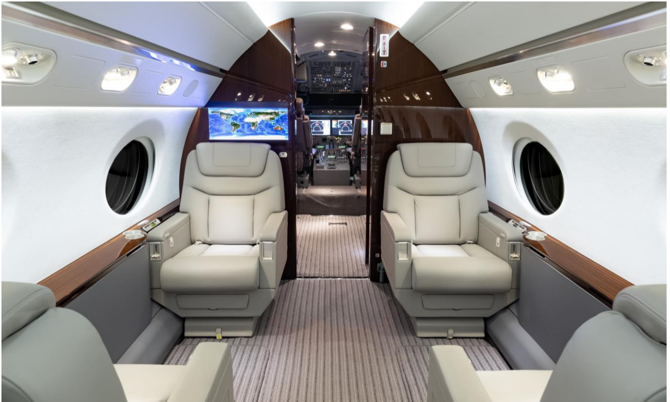
Forward-Cabin Looking Forward