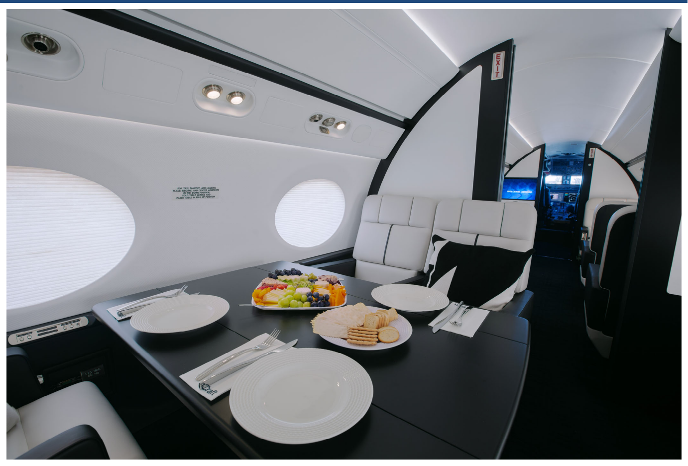
Mid Cabin Looking Fwd