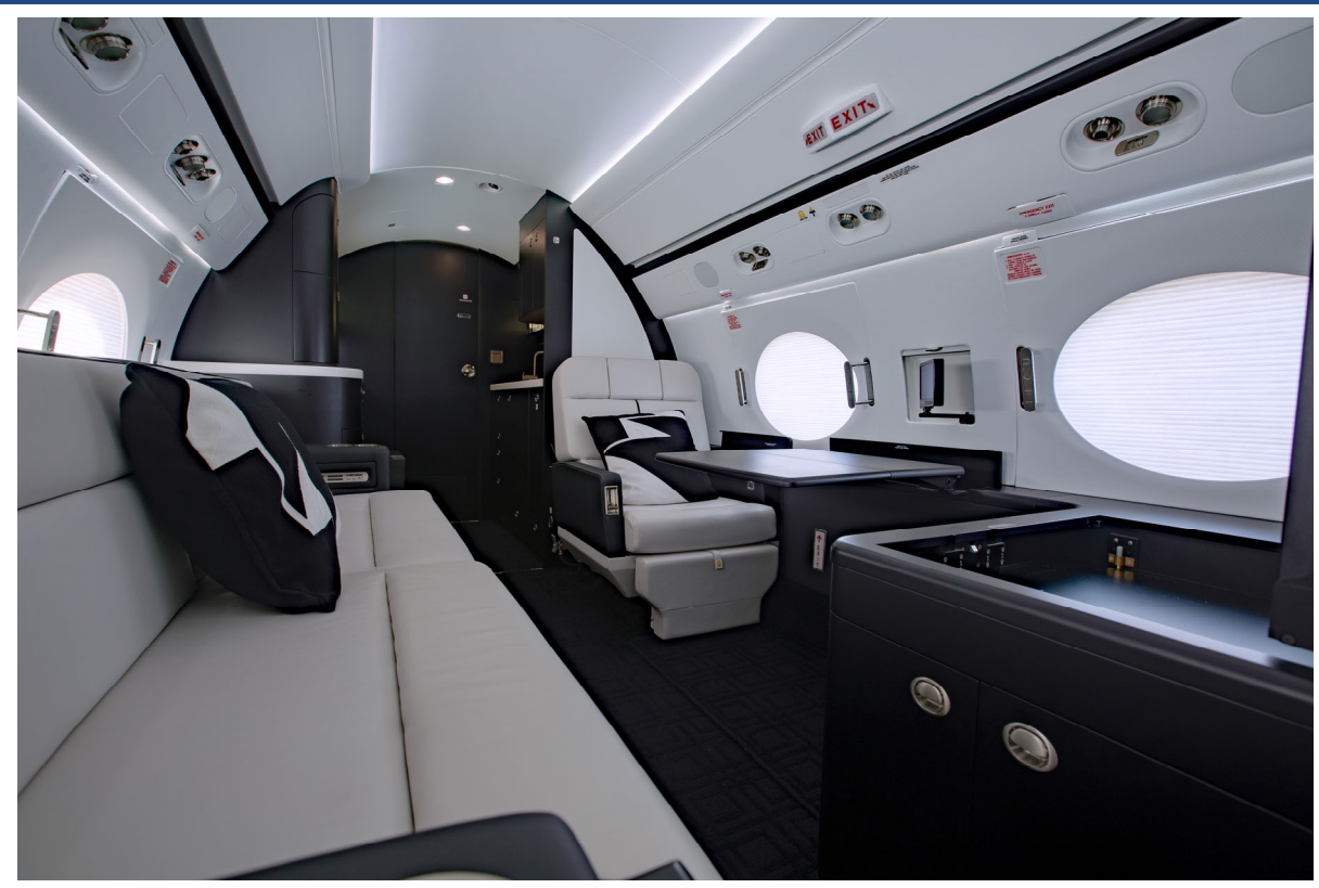
Aft Cabin looking Aft