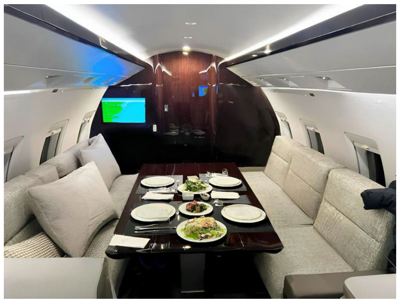
Aft Dining Table

\label{link-to-video} \begin{tabular}{ll} Link to Video of Dining Table - $$\underline{\t https://www.dropbox.com/scl/fi/cff6xdtmwhmr2abnlfkci/Dining-Table.mp4?rlkey=qmux14f26emqvzb0v5fkyidah&dl=0 \\ \end{tabular}