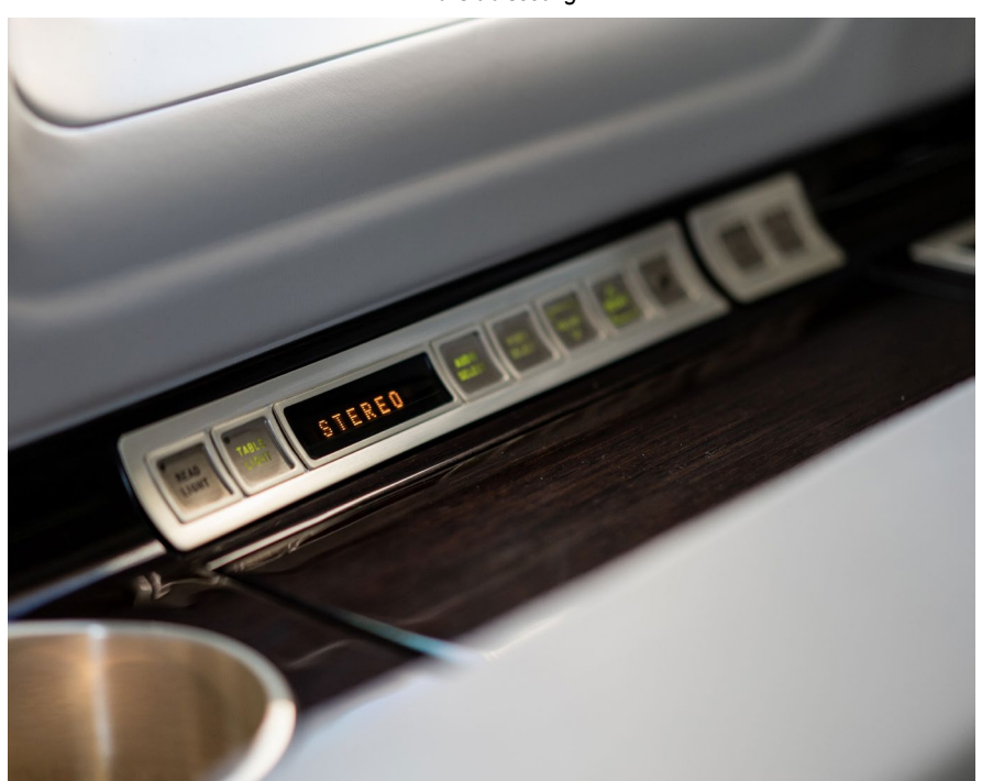
Fwd Cabin Controls